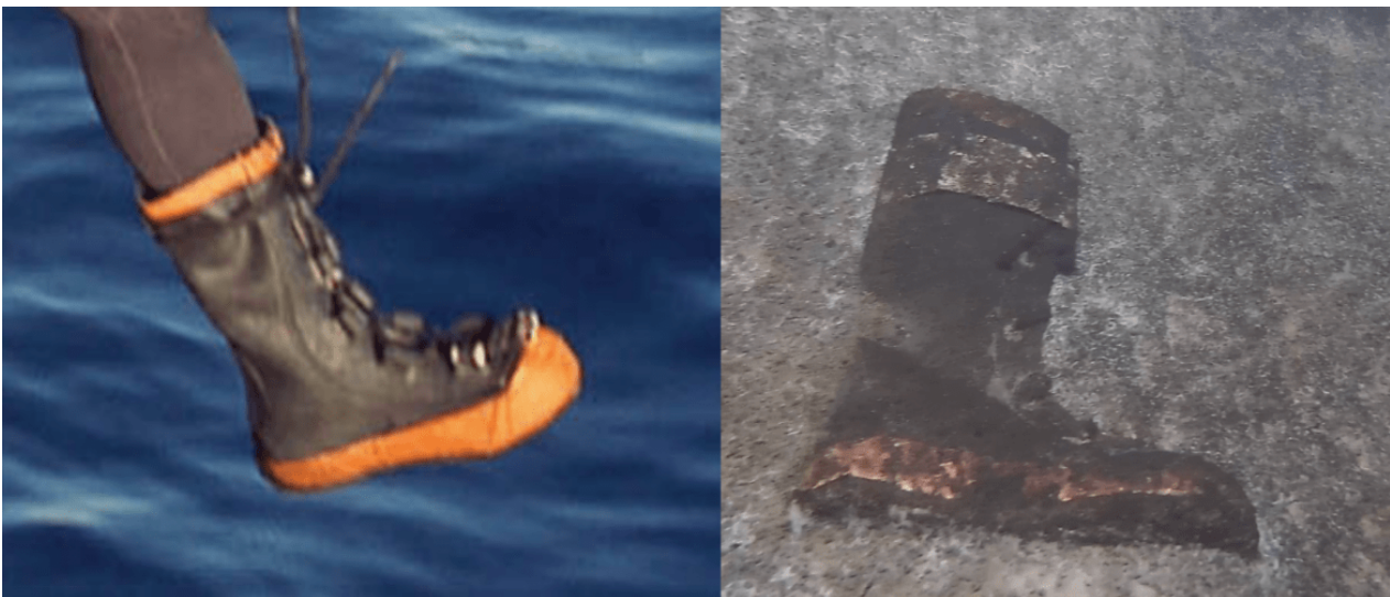
Fig. 4. A close-up of the US Navy diver boot (left) and the boot spotted on the expedition (right).