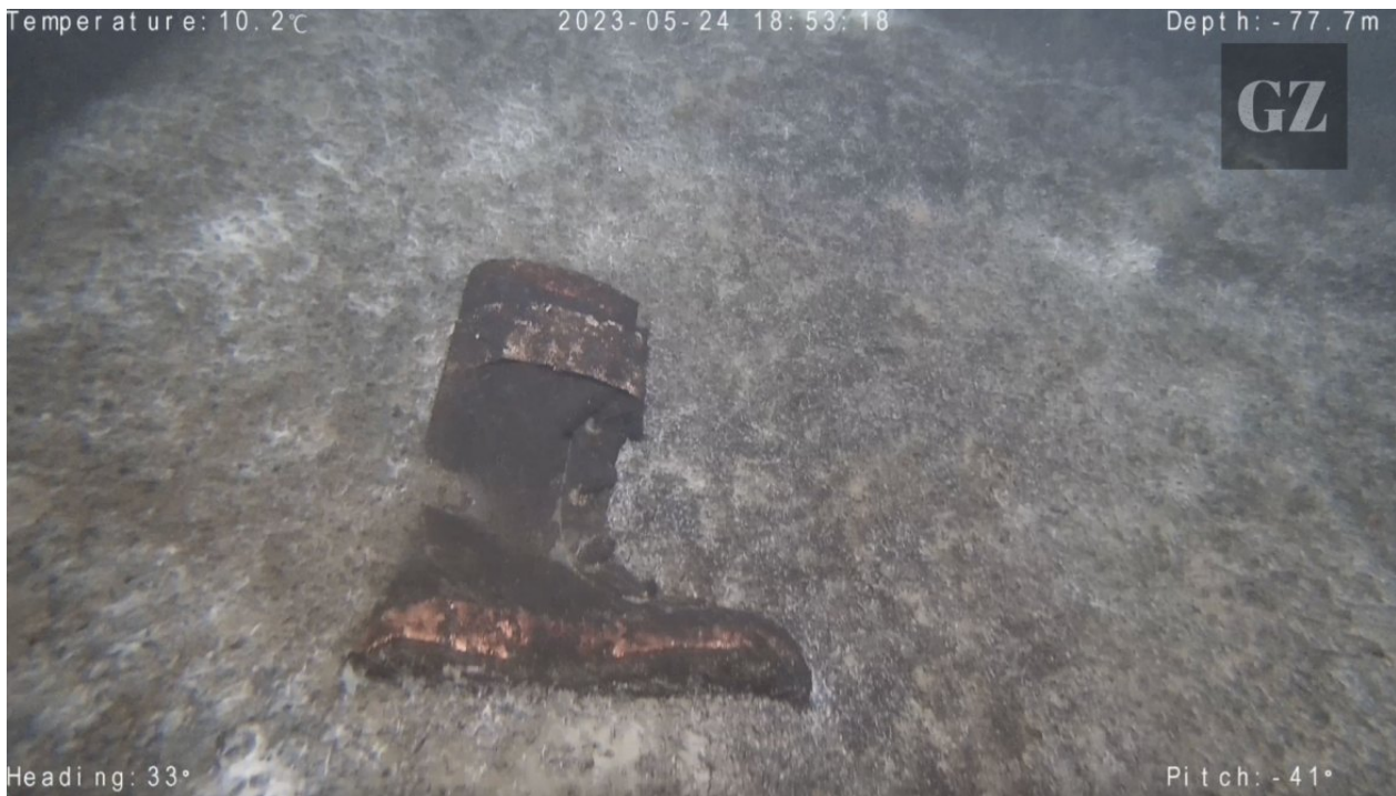
Fig. 2 The boot spotted by the expedition's drone.

It is unknown for how long the boot had been exposed on the seafloor (as seen in Fig. 2). Andersson, the organizer of the expedition, believes it is possible the boot was previously covered by sediment or mud which may have been moved by underwater currents or the blasts. Otherwise, it is unclear how investigators could have missed it.