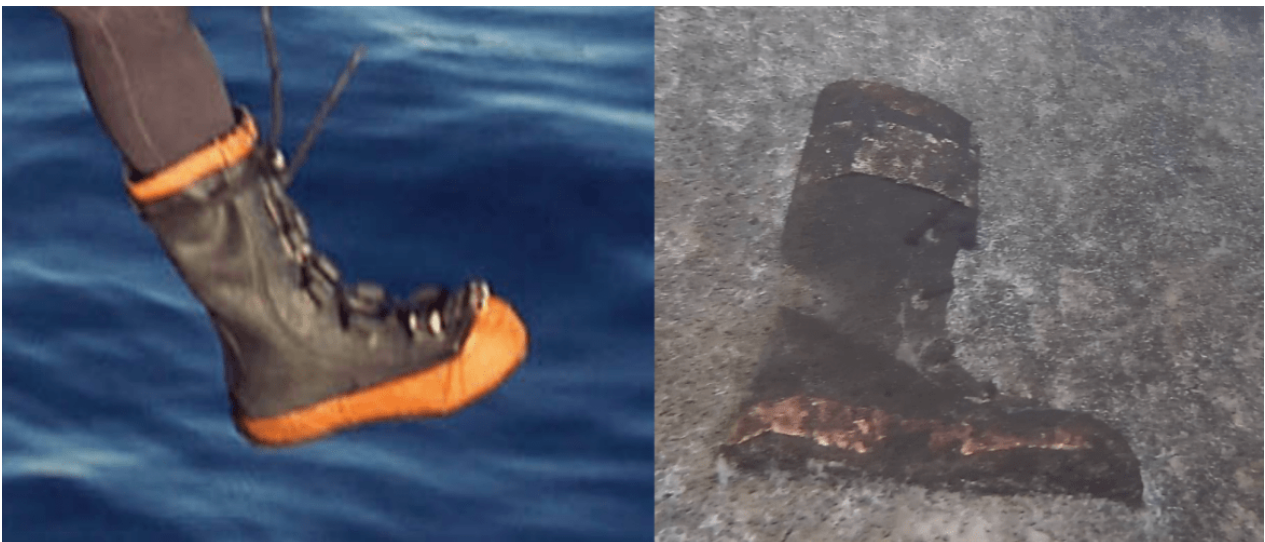
Fig. 4. A close-up of the US Navy diver boot (left) and the boot spotted on the expedition (right).