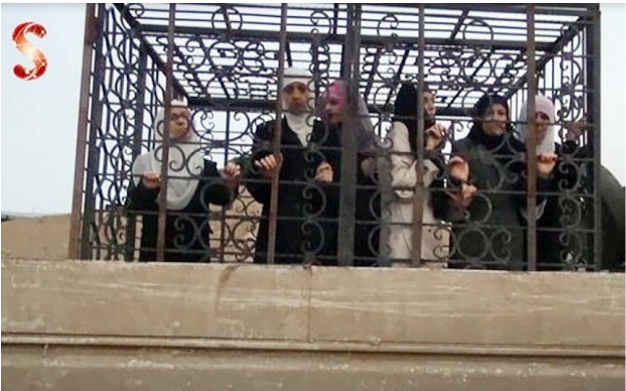
Image: BBC's "US-backed rebel commander" heads a faction that includes the terrorist Jaysh al-Islam faction who caged civilians and used them as human shields outside of Damascus. The US insists that Syria and Russia must negotiate with such organizations and that such organizations should play a role in Syria's future.

It appears, ironically enough, that through the deception of the Western media, al Nusra has been amply assisted in fully hijacking "the struggles of the Syrian people for its own malign purposes."