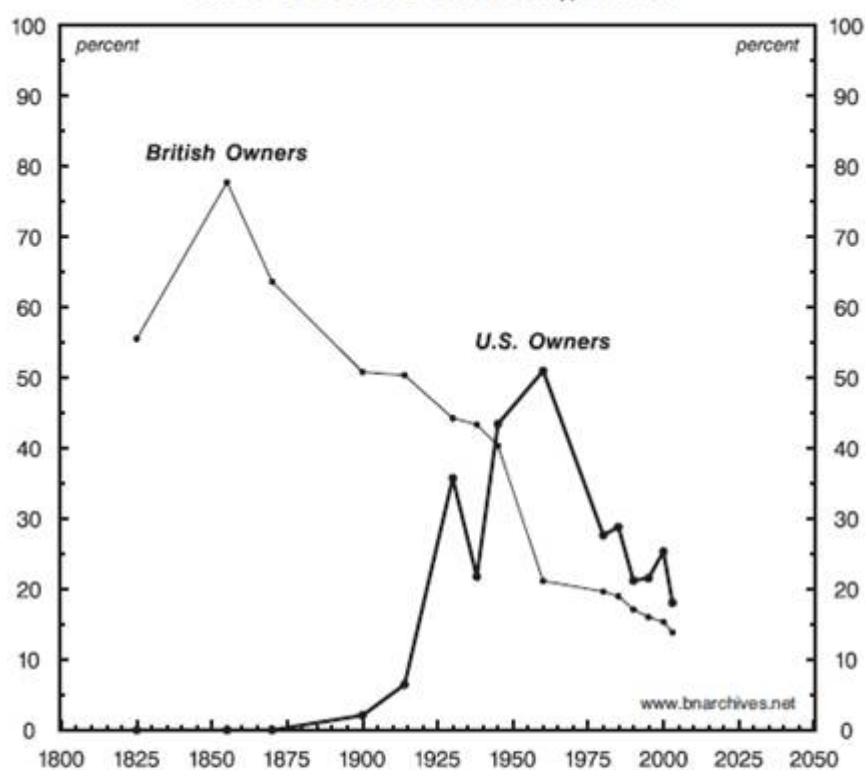
Figure 2 Share of Global Gross Foreign Assets

NOTE: Gross foreign assets consist of cash, loans, bonds and equities owned by non-residents. The last data point is for 2003.