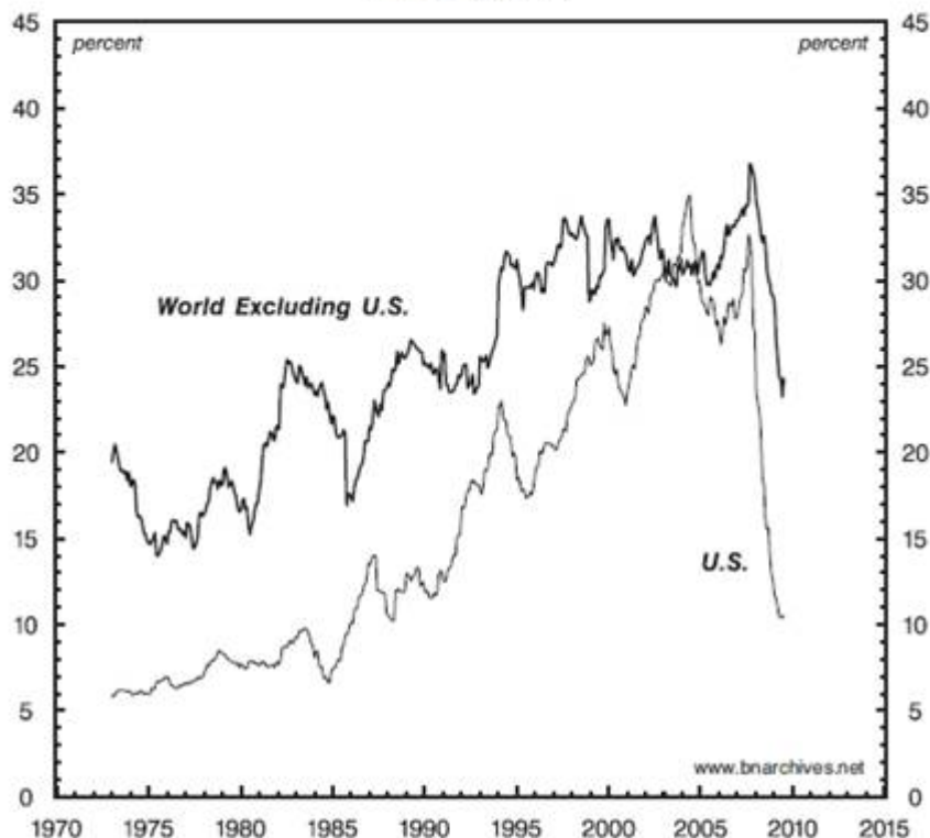
Figure 4 Net Profit Shares of Listed FIRE Corporations (% of Region)

NOTE: Net profit is computed as the ratio of market value to the price-earning ratio. Total and FIRE profit for firms outside the U.S. are calculated as a residual, by subtracting from the world figures the corresponding figures for the U.S. The last data points are for July 31, 2009.