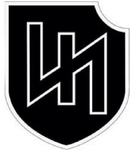
Emblem of the SS Division Das Reich.