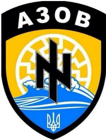
Emblem of the Azov Battalion formed by Kiev's junta.