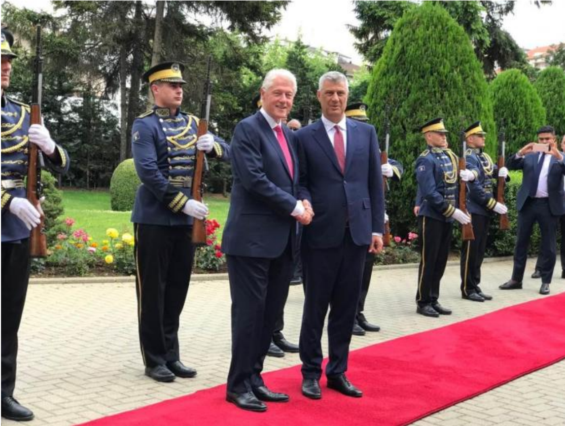
Former U.S. President Bill Clinton embraces Kosovo's President Hashim Thaçi after being given an award in Pristina in June 2019.

Four years later, Thaçi is no longer in power but a defendant at The Hague in the Netherlands at a special tribunal funded by the European Union. He stands accused of committing war crimes and crimes against humanity when he was a senior member of the Kosovo Liberation Army (KLA), including torturing and then ordering the execution of fellow Kosovo Albanians accused of being traitors and collaborators.