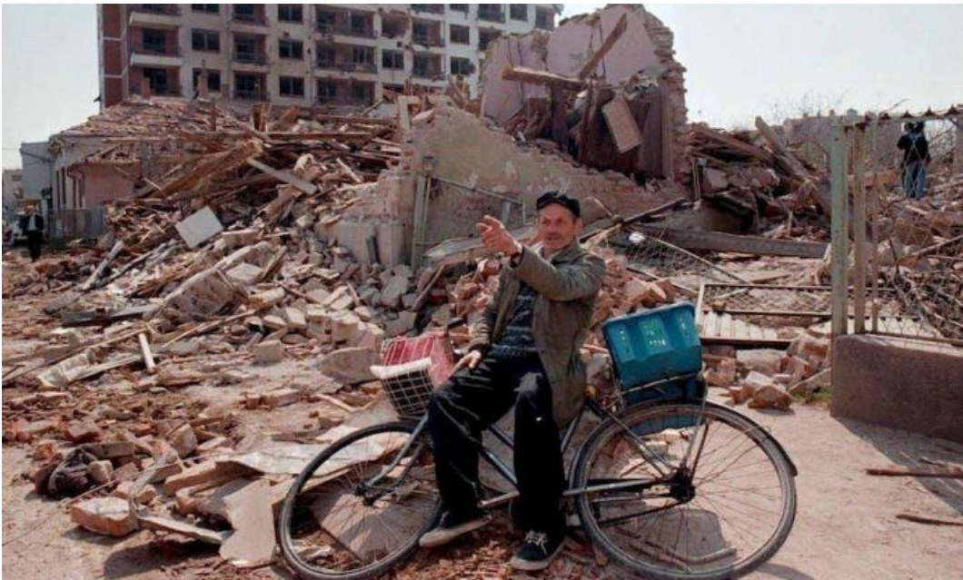
Wreckage from U.S.-NATO bombing in Kosovo in the spring of 1999.

With KLA assistance, American warplanes bombed Zastava automobile plant, a Serb government TV station, and the Chinese Embassy in the part that housed intelligence operatives, killing four, likely in an effort to intimidate the Chinese from using their veto over the UN Security Council (The official U.S. explanation was that it was using an “old map” of the city). [8]