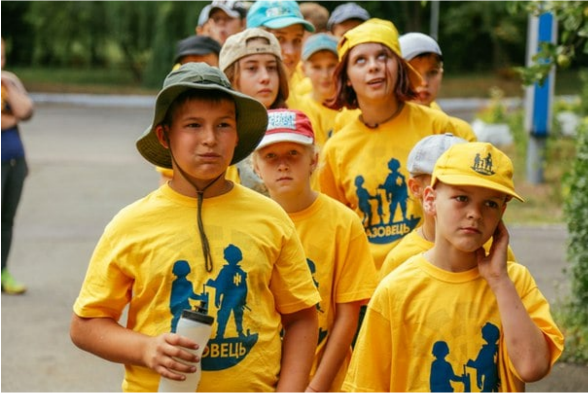
The Nazi Wolfsangel SS symbol on their T-Shirts Nazi tatoos insignia on Azov trainer's arm