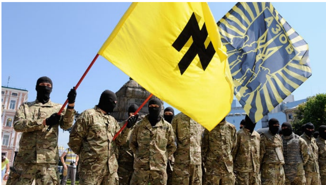
The Nazi SS Wolfsangel symbol

These are the Nazi terrorists who are killing children in Donbass. Their legitimacy is tacitly upheld by the I.C.C. They are generously funded by the "International Community".