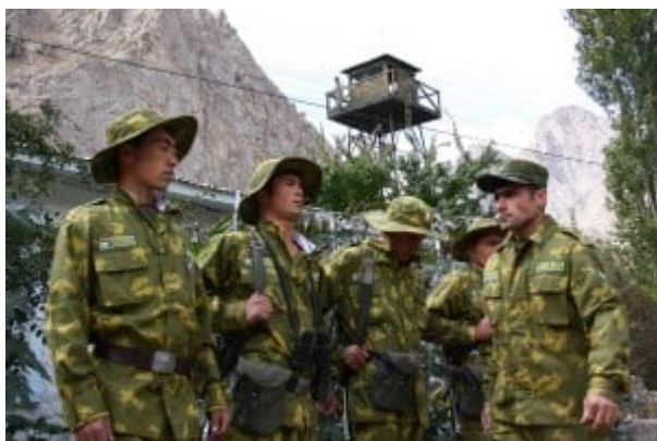
Tajik border guards

The threat facing Tajikistan is structurally similar to the one in Kyrgyzstan, and it’s that the country’s large swath of mountainous geography could be exploited by terrorist groups in facilitating smuggling routes or providing cavernous shelter. It goes without saying that Tajikistan’s border with Afghanistan is perhaps its greatest vulnerability, but some respite could be found in the fact that there are more ethnic Tajiks in Afghanistan than in Tajikistan, and that if this community were properly mobilized to its fullest extent, then it could provide an effective bulwark against the Taliban and other terrorist groups. At the moment, however, this doesn’t seem to be the case, since the Taliban was able to briefly capture the northern provincial capital of Kunduz at the end of September and achieve their greatest military success since 2001.