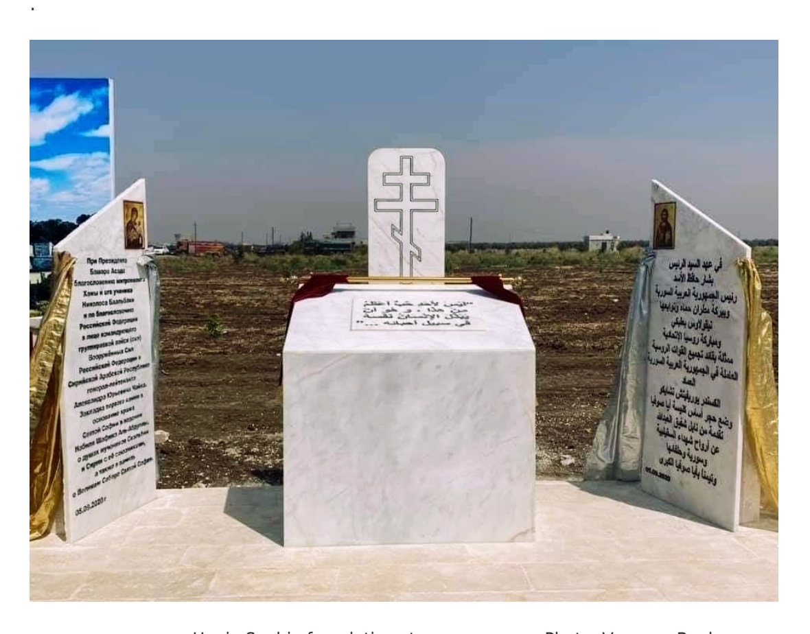
Hagia Sophia foundation stone ceremony.

"Our Russian friends heard about this initiative from the media, so they mentioned the project to the Duma and this is evidence of their opposition to Erdogan's actions. However, the church will be built only with hands from Sqeilbiyyeh and with Syrian stone, on my land and I will finance the project personally – just as our ancestors preserved our heritage and our land, so we shall do the same."