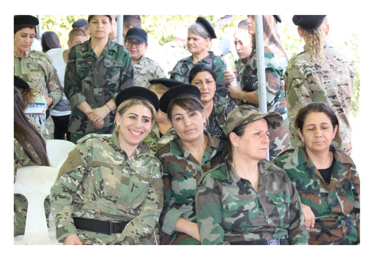
Sqeilbiyyeh female defenders – mothers, wives, sisters and relatives of martyrs have taken up arms and trained with Russian forces to defend their city.