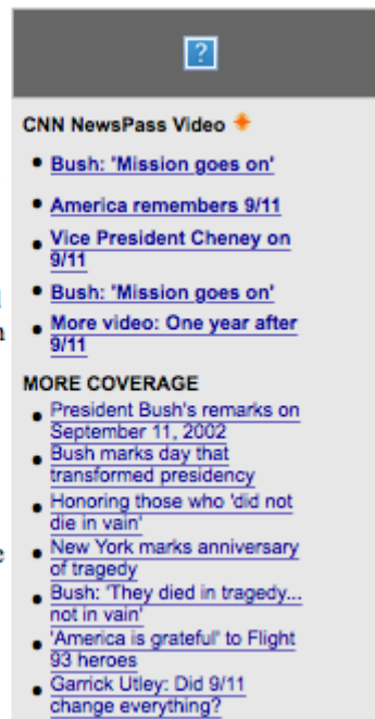
Screenshot of CNN article, September 11, 2001

"The vice president said yes again," remembered Josh Bolton, deputy White House chief of staff. "And the aide then asked a third time. He said, 'Just confirming, sir, authority to engage?' And the vice president -- his voice got a little annoyed then -- said, 'I said yes.'"