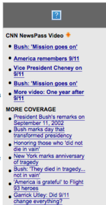
Screenshot of CNN article, September 11, 2001

"The vice president said yes again," remembered Josh Bolton, deputy White House chief of staff. "And the aide then asked a third time. He said, 'Just confirming, sir, authority to engage?' And the vice president -- his voice got a little annoyed then -- said, 'I said yes.'"