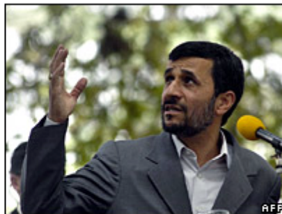
The tool detected changes to a page about Mahmoud Ahmadinejad

Wikipedia Scanner allegedly shows that workers on the agency's computers made edits to the page of Iran's president.