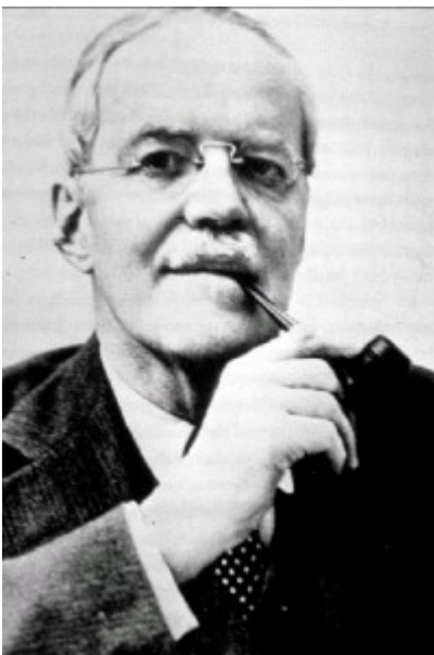
Former CIA Director Allen Dulles

Though the World War II generation has largely passed from the scene and the Cold War ended more than two decades ago, the consequences of Dulles's actions in those final days of World War II are still reverberating in Germany.