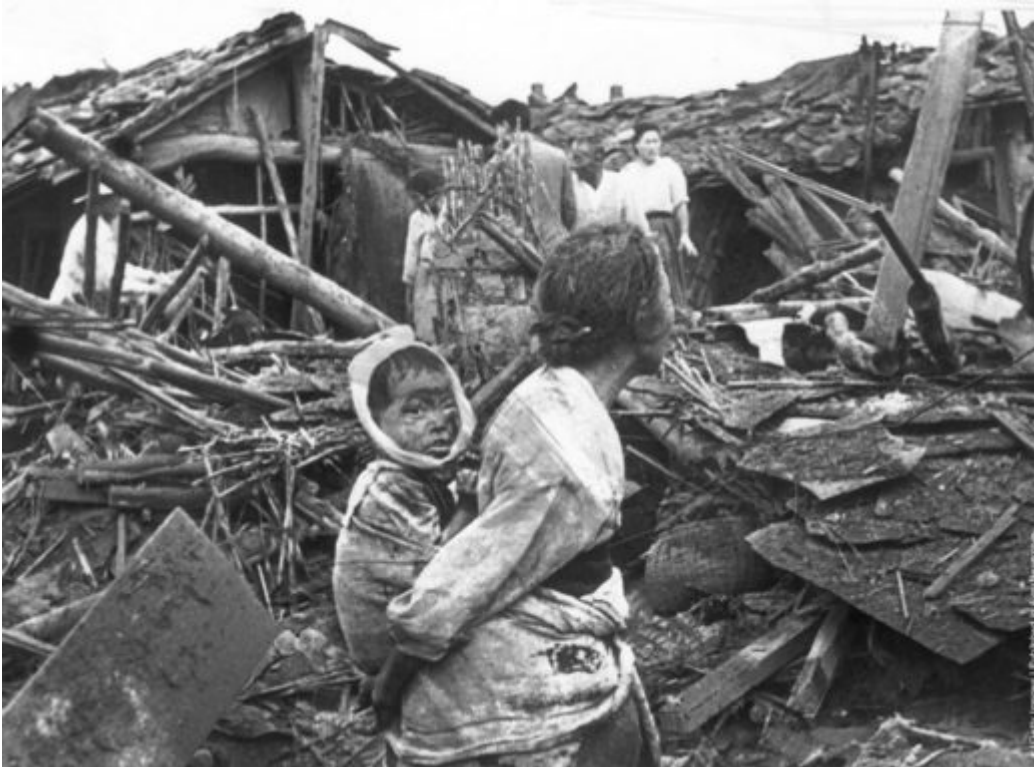
Survivors of a bombed out North Korean village.

The Korean conflict would transform the US into a very different country than it had ever been before: one with hundreds of permanent military bases abroad, a large standing army and a permanent national security state at home.