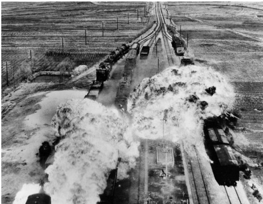
US Air Force attacking railroads south of Wonsan on the eastern coast of North Korea.

Now we understand why North Korea distrusts the US so much. The message behind its apparent belligerence is simply: ‘Stay Away!’