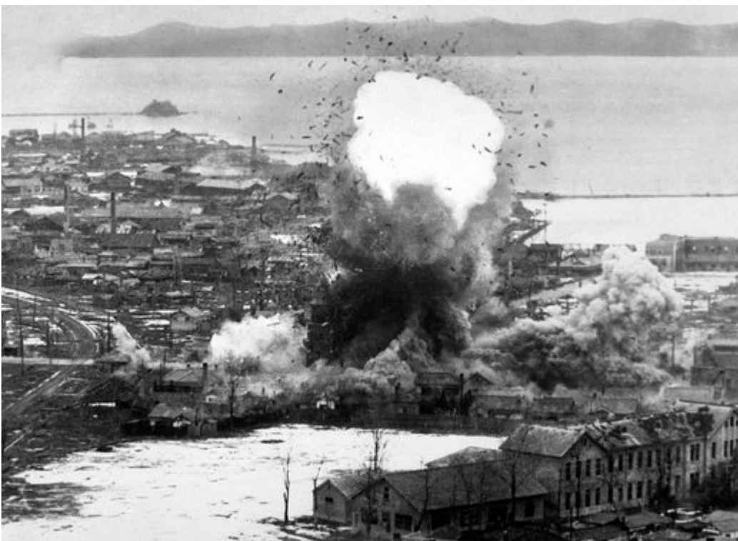
US Air Force bombers destroy warehouses and dock facilities in Wonsan, North Korea, 1951.