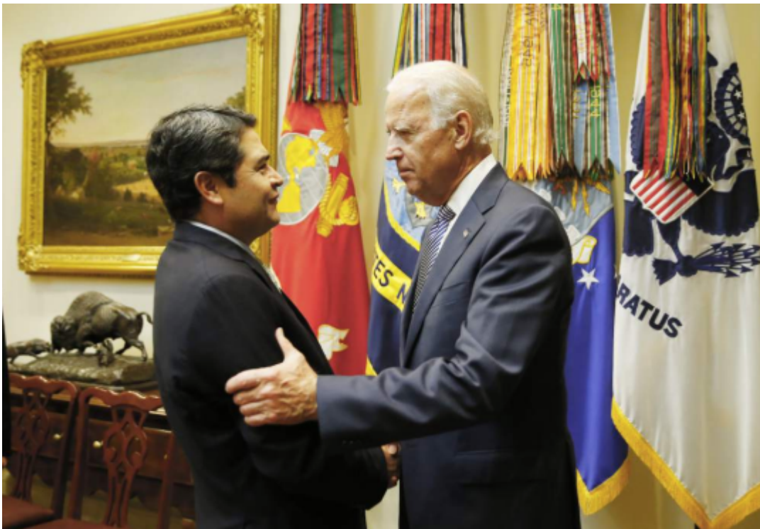
Joseph Biden embraces Juan Orlando Hernandez in Guatemala City, February 2016

“I come from a state that, in fact, is the corporate capital of America. More corporations are headquartered there than anywhere else,” Biden boasted , with Hernández and the presidents of Guatemala and El Salvador standing by his side. “They want to come here. Corporate America wants to come.”