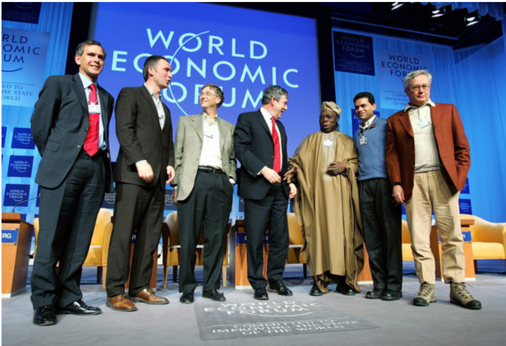
Gates at the 2006 World Economic Forum advising policy makers.

One recent example is the 2021 “High-Level Dialogue on Feeding Africa” that was held on 29-30 April this year. 12 This forum, funded by the Gates Foundation, and organised by a number of Gates Foundation grantees such as the African Development Bank, CGIAR and AGRA, was meant to launch a policy and funding agenda to further push the Green Revolution into Africa. The event attracted no less than 18 African heads of state and several other high-profile personalities. But, most remarkable of all, is that of all the international organisations with activities in Africa on the long speakers list of the dialogue, virtually all are Gates grantees. The forum concluded with a commitment to double agricultural productivity, something AGRA and the Gates Foundation have been promising and failing to deliver for the last decade and a half.