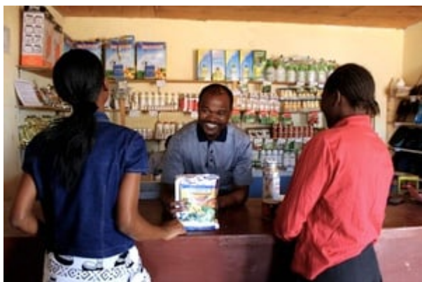
An agro-dealer in Malawi.

“Agro-dealers... act as vessels for promoting input suppliers’ products,” says one MASP project document. Another states: “supply companies have expressed their appreciation for field days because MASP trained agro-dealers are helping them promote their products in the very remotest areas of Malawi.” Training the agro-dealers on product knowledge is carried out by the corporate suppliers of the products themselves. In addition, these agro-dealers are increasingly the source of farming advice to small farmers, and an alternative to the government’s agricultural extension service.