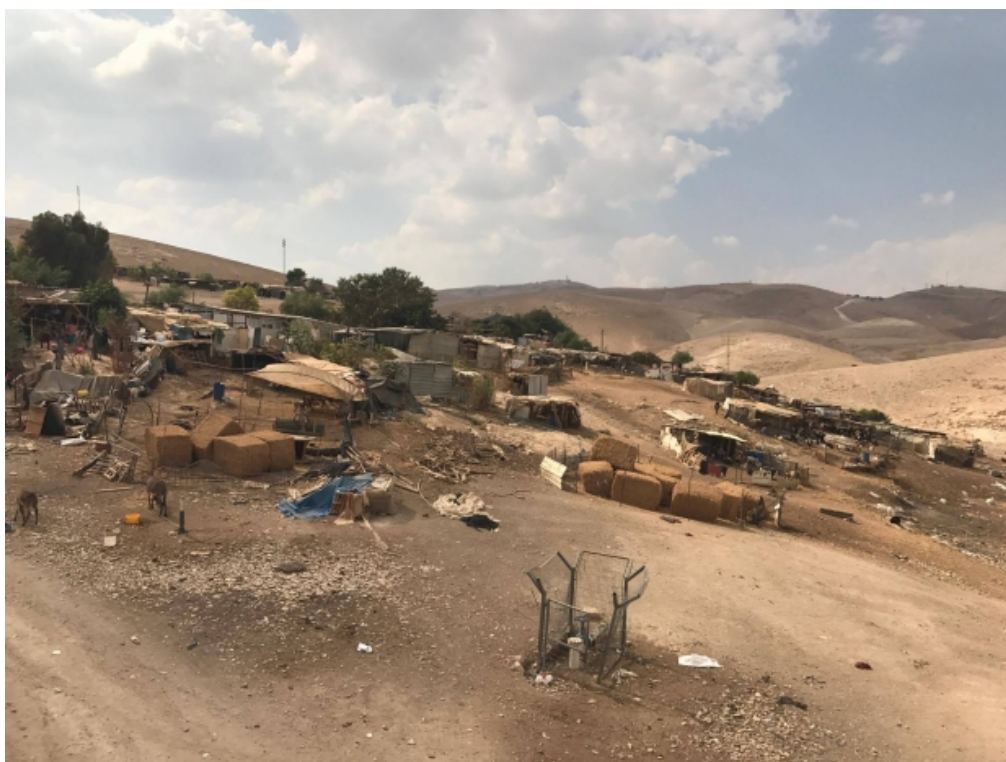
Buildings in Khan al-Ahmar are mostly constructed from tin sheets and wooden panels

I asked myself: what do the settlers see when they look down on the Bedouin? Criminals? Terrorists? A human sub-species which can be disposed and redispersed of at will?