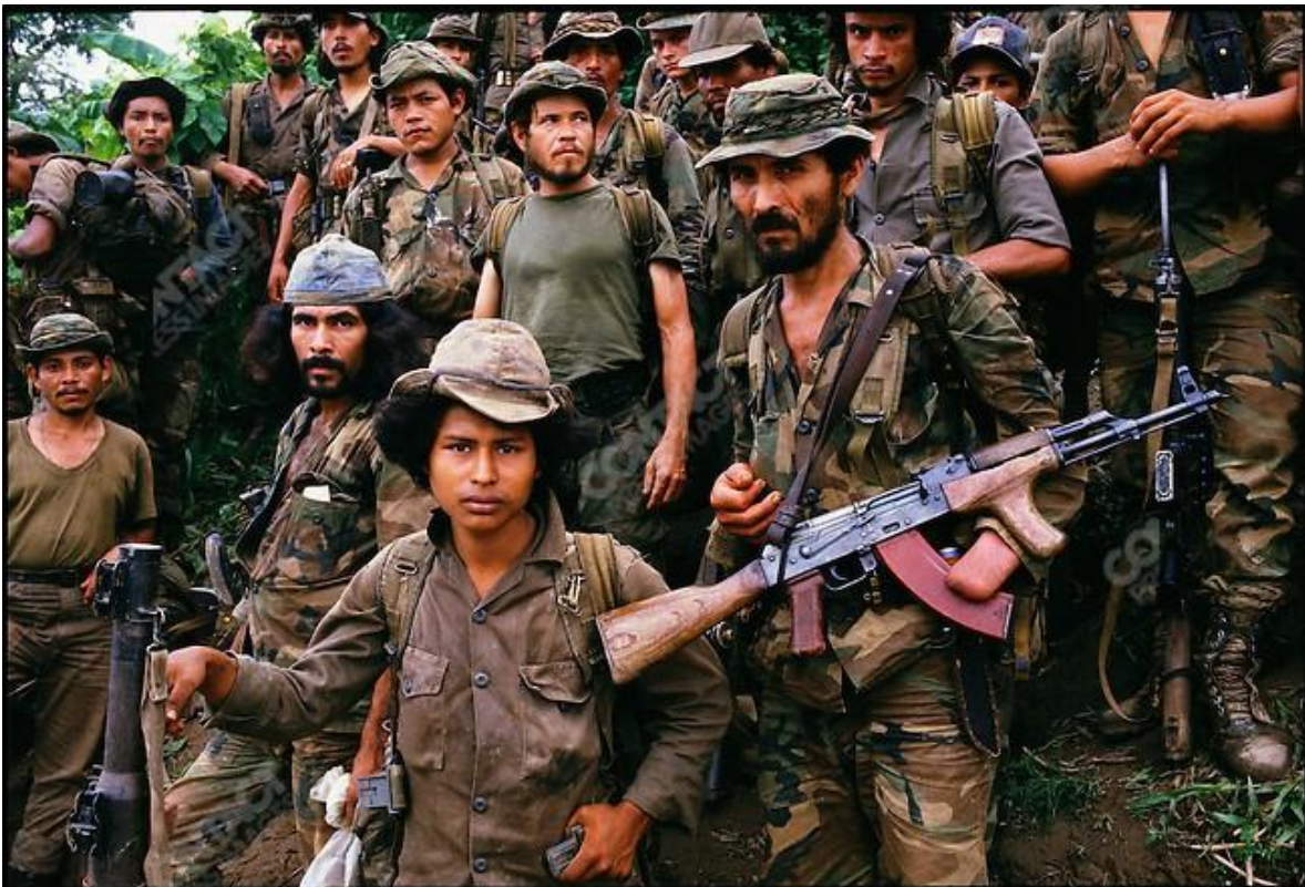
Contra fighters in the 1980s included Miskito Indians.

The Miskito indigenous in Nicaragua are not new to conflict. During the 1980s the CIA manipulated them to advance their proxy Contra army. Many Nicaraguans died as a result. Now, 35 years later, people such as Elliott Abrams are trying to use the Miskito all over again. The Miskito may have legitimate grievances against the Nicaraguan government. But are their supposed champions in the U.S. seeking a solution or are they seeking to use them for their own purposes? There is a big difference.