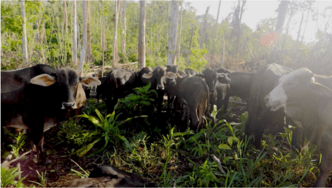
Cattle farm in Indio Maíz Biological Reserve in Nicaragua.

have declined. Nicaragua has helped fill the gap by exporting larger quantities of high-quality beef to the U.S.