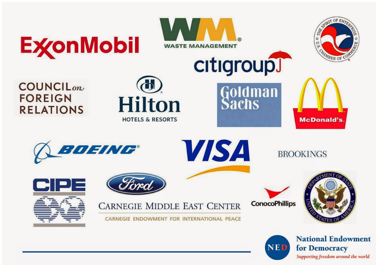
Image: Attempts to claim that the US through NED are simply seeking to “promote democracy” fall short when considering the immense, exploitative, corporate-financier interests represented by NED’s board of directors (pictured above). It is difficult to believe that Boeing, Ford, McDonald’s Exxon, Goldman Sachs, and others care about “democracy” and not simply a new way to sell their global hegemonic ambitions for greater power and wealth.

is somehow still “progress.” It is human to fall, it is human to feel embarrassed, but it is also human to rise above our petty pride and pursue the truth no matter what the personal cost.