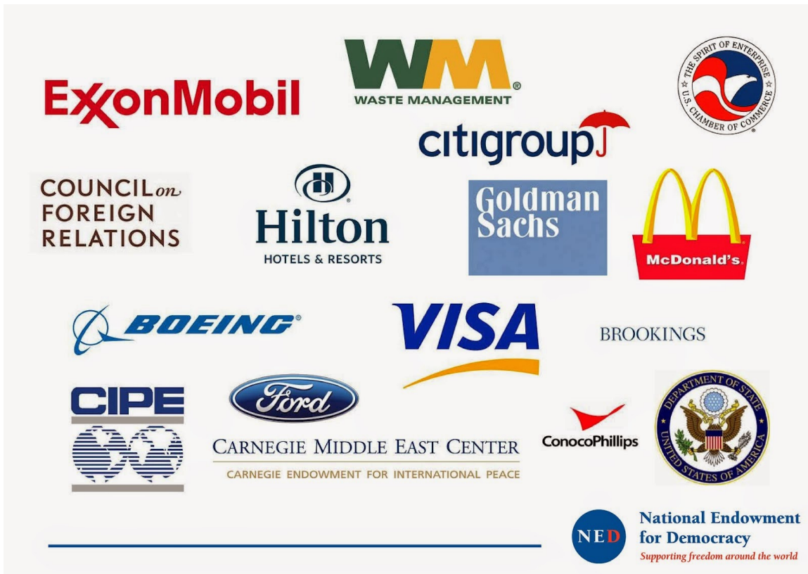
Image: The National Endowment for Democracy and its various subsidiaries including the National Democratic Institute, are backed by immense corporate-financier interests who merely couch their hegemonic agenda behind “promoting democracy” and “freedom” worldwide. Above is a representation of the interests present upon NED’s board of directors.

It has already been extensively documented that each and every “Occupy Central” leader is either directly tied to the US State Department , or is parroting verbatim talking points by someone who is.