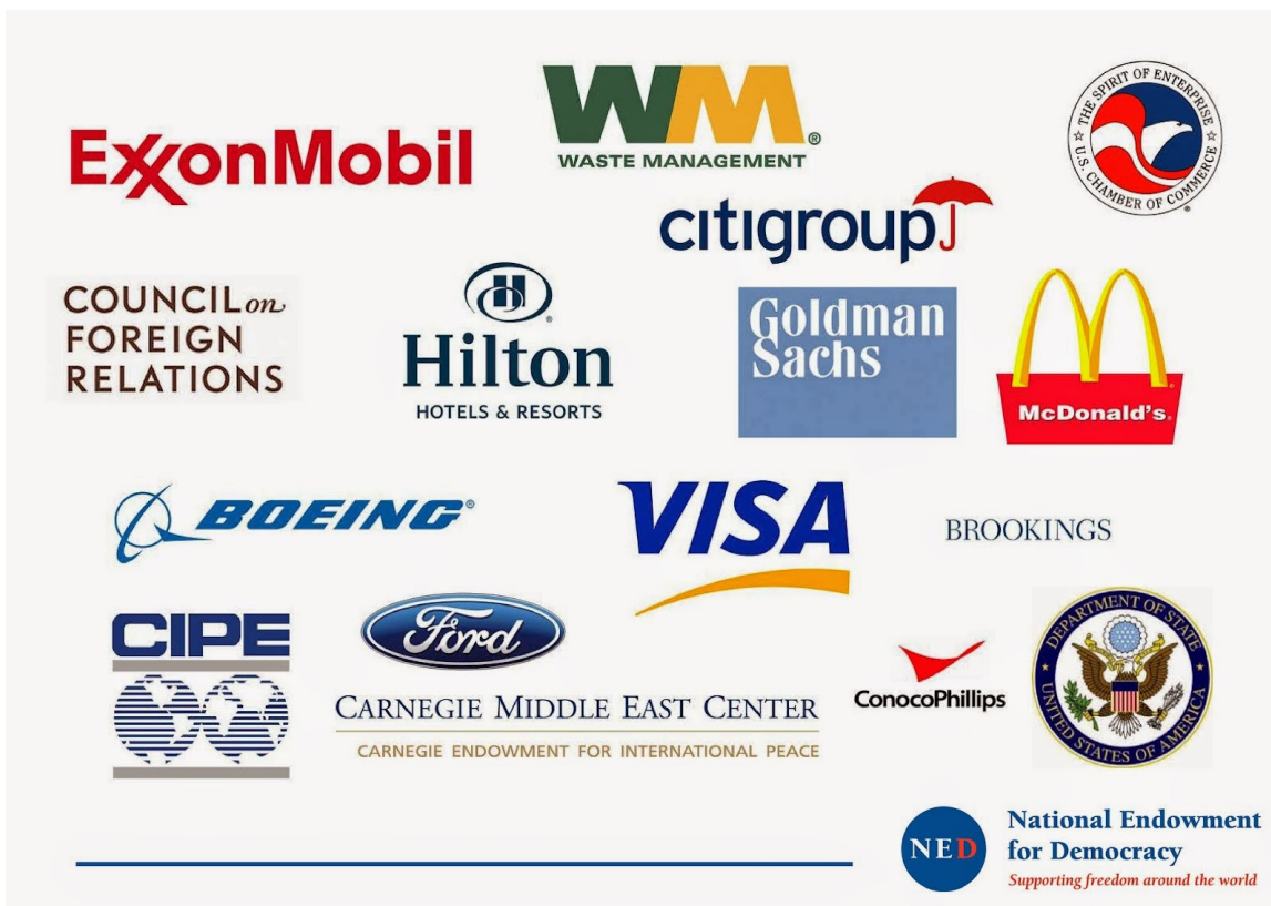
Image: The National Endowment for Democracy and its various subsidiaries including the National Democratic Institute, are backed by immense corporate-financier interests who merely couch their hegemonic agenda behind “promoting democracy” and “freedom” worldwide. Above is a representation of the interests present upon NED’s board of directors.

It has already been extensively documented that each and every “Occupy Central” leader is either directly tied to the US State Department , or is parroting verbatim talking points by someone who is.