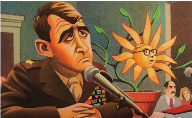
Oliver North defended the “enterprise” in Congressional Testimony.

leaving Florida without official clearance. Nevertheless, both the weapons and drugs reached their destinations, and the same network — in which Barry Seal was one cog — conducted both operations.