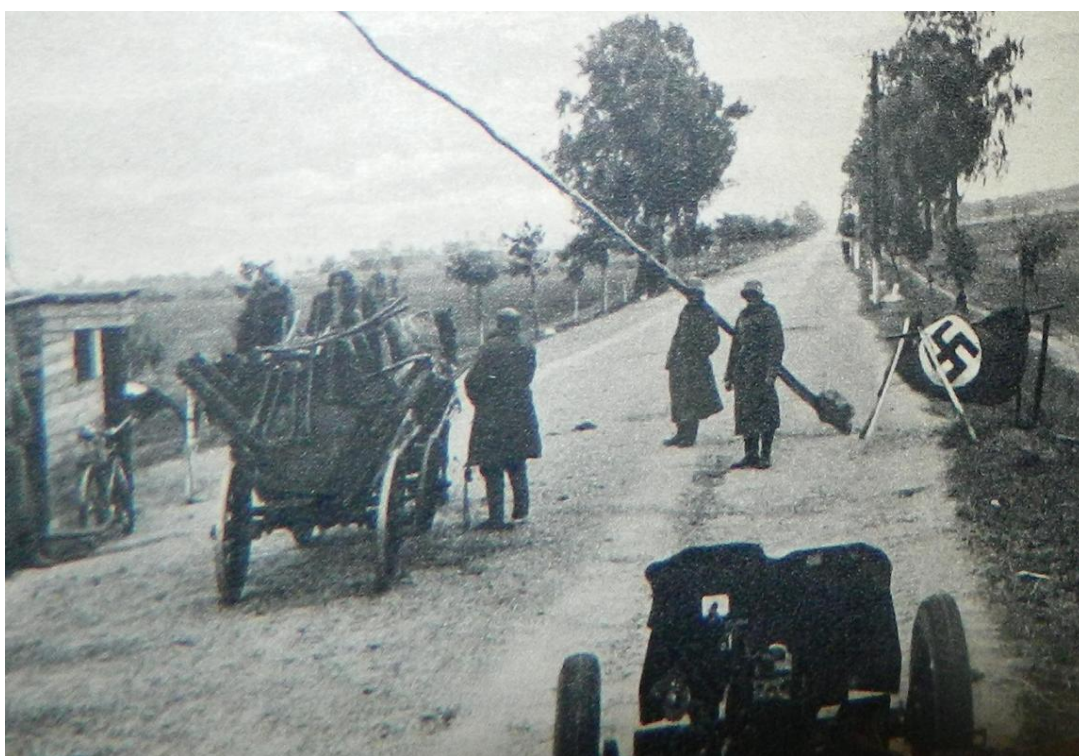
The new border between Nazi Germany and Soviet Russia from September 1939 to June 1941, somewhere in the occupied territory of Poland

Thanks to the concessions that had already been made, Nazi Germany was becoming a military Behemoth, and in 1939 only a common front of the Western powers and the Soviets seemed to be able to contain it, because in case of war, Germany would have to fight on two fronts. Under heavy pressure from public opinion, the leaders in London and Paris agreed to negotiate with Moscow, but there was a fly in the ointment: Germany did not share a border with the Soviet Union, because Poland was sandwiched between those two countries. Officially, at least, Poland was an ally of France, so it could be expected to join a defensive alliance against Nazi Germany, but, the government in Warsaw was hostile towards the Soviet Union, a neighbour that was considered as much a menace as Nazi Germany. It stubbornly refused to allow the Red Army, in case of war, to cross into Polish territory in order to do battle against the Germans. London and Paris declined to put pressure on Warsaw, and so the negotiations did not produce an agreement.