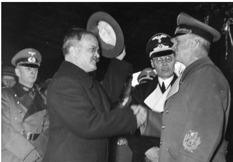
Ribbentrop taking leave of Molotov in Berlin, November 1940

In the meantime, Berlin had discreetly launched a rapprochement towards Moscow. Why? Hitler felt betrayed by London and Paris, who had earlier made all sorts of concessions but now denied him the trifle of Gdansk and sided with Poland, and thus faced the prospect of war against Poland, which refused to let him have Gdansk, and against the Franco-British duo. To be able to win this war, the German dictator needed the Soviet Union to remain neutral, and for that he was willing to pay a high price. From Moscow's perspective, Berlin's overture contrasted starkly with the attitude of the Western appeasers, who demanded that the Soviets make binding promises of assistance, but without offering a meaningful quid pro quo. What had started between Germany and the Soviet Union in May as informal discussions within the context of commercial negotiations without great importance, in which the Soviets initially did not show interest, eventually morphed into a serious dialogue involving the two countries' ambassadors and even foreign ministers, namely Joachim von Ribbentrop and Vyacheslav Molotov – the latter having replaced Litvinov.