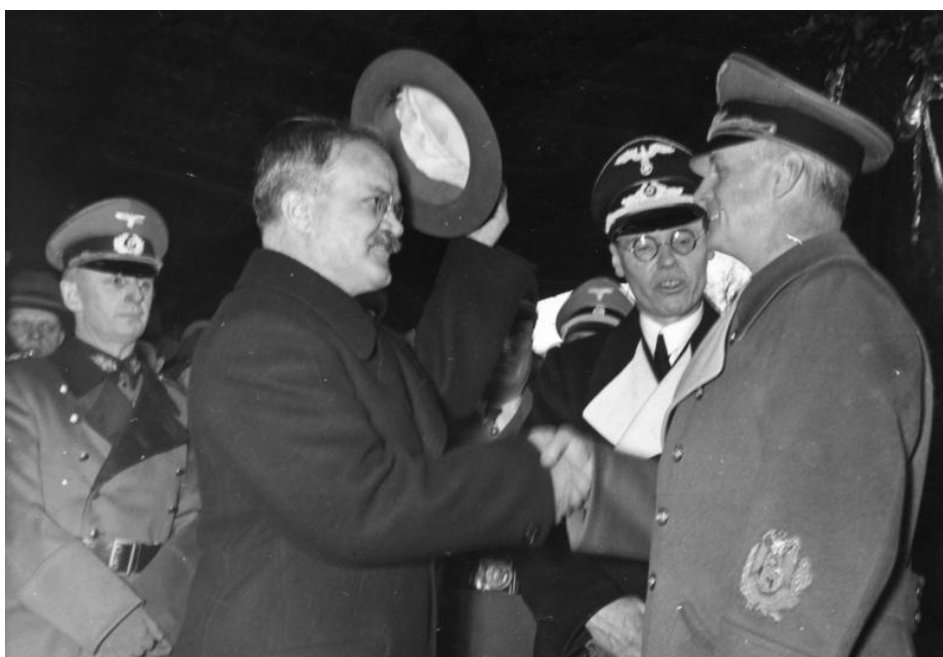
Ribbentrop taking leave of Molotov in Berlin, November 1940

In the meantime, Berlin had discreetly launched a rapprochement towards Moscow. Why? Hitler felt betrayed by London and Paris, who had earlier made all sorts of concessions but now denied him the trifle of Gdansk and sided with Poland, and thus faced the prospect of war against Poland, which refused to let him have Gdansk, and against the Franco-British duo. To be able to win this war, the German dictator needed the Soviet Union to remain neutral, and for that he was willing to pay a high price. From Moscow's perspective, Berlin's overture contrasted starkly with the attitude of the Western appeasers, who demanded that the Soviets make binding promises of assistance, but without offering a meaningful quid pro quo. What had started between Germany and the Soviet Union in May as informal discussions within the context of commercial negotiations without great importance, in which the Soviets initially did not show interest, eventually morphed into a serious dialogue involving the two countries' ambassadors and even foreign ministers, namely Joachim von Ribbentrop and Vyacheslav Molotov – the latter having replaced Litvinov.