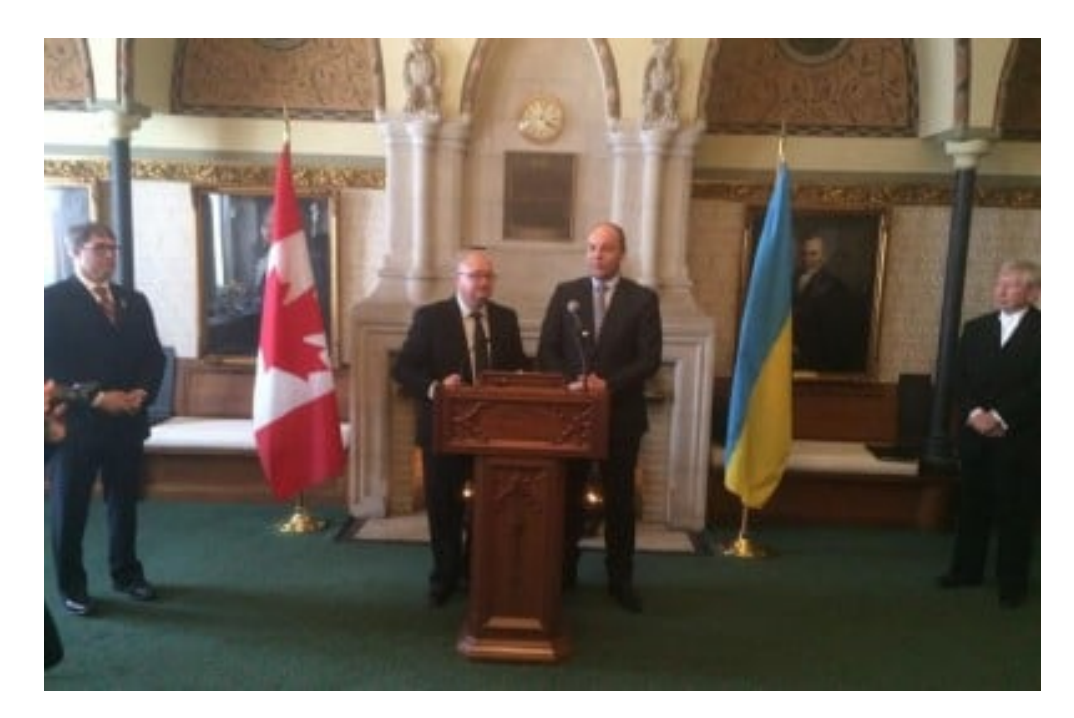
Received by the Canadian Parliament