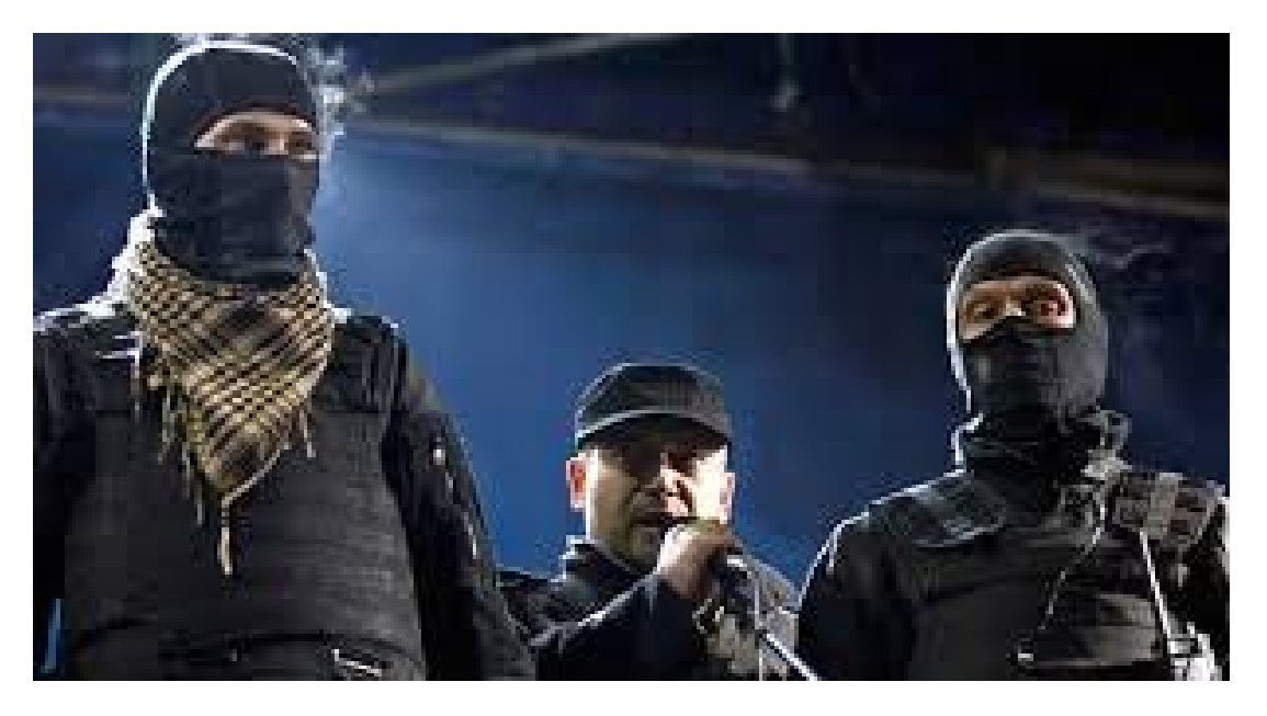
Dmytro Yarosh (Centre) EuroMaidan Coup d'Etat

Amply documented, <u>the 2014 EuroMaidan US Sponsored Coup d'Etat was carried out with</u> <u>the support of the two Nazi factions</u>: Svoboda and Right Sektor headed by Dmytro Yarosh