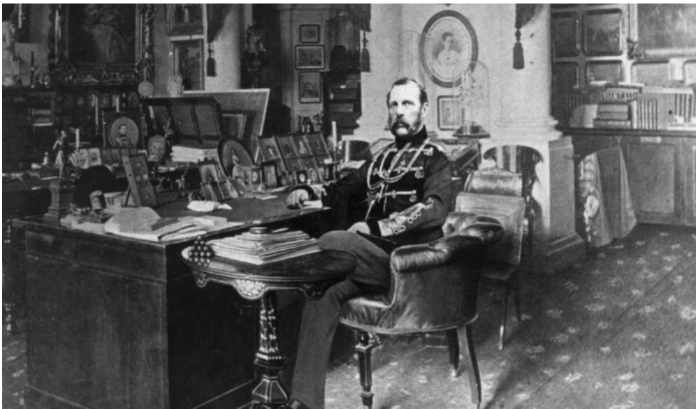
Czar Alexander II at his desk.

When Abraham Lincoln entered the office of the Presidency in the spring of 1861, Russian Czar Alexander II had just the day before abolished serfdom, which had held 20 million Russians in bondage to the land and its owners.