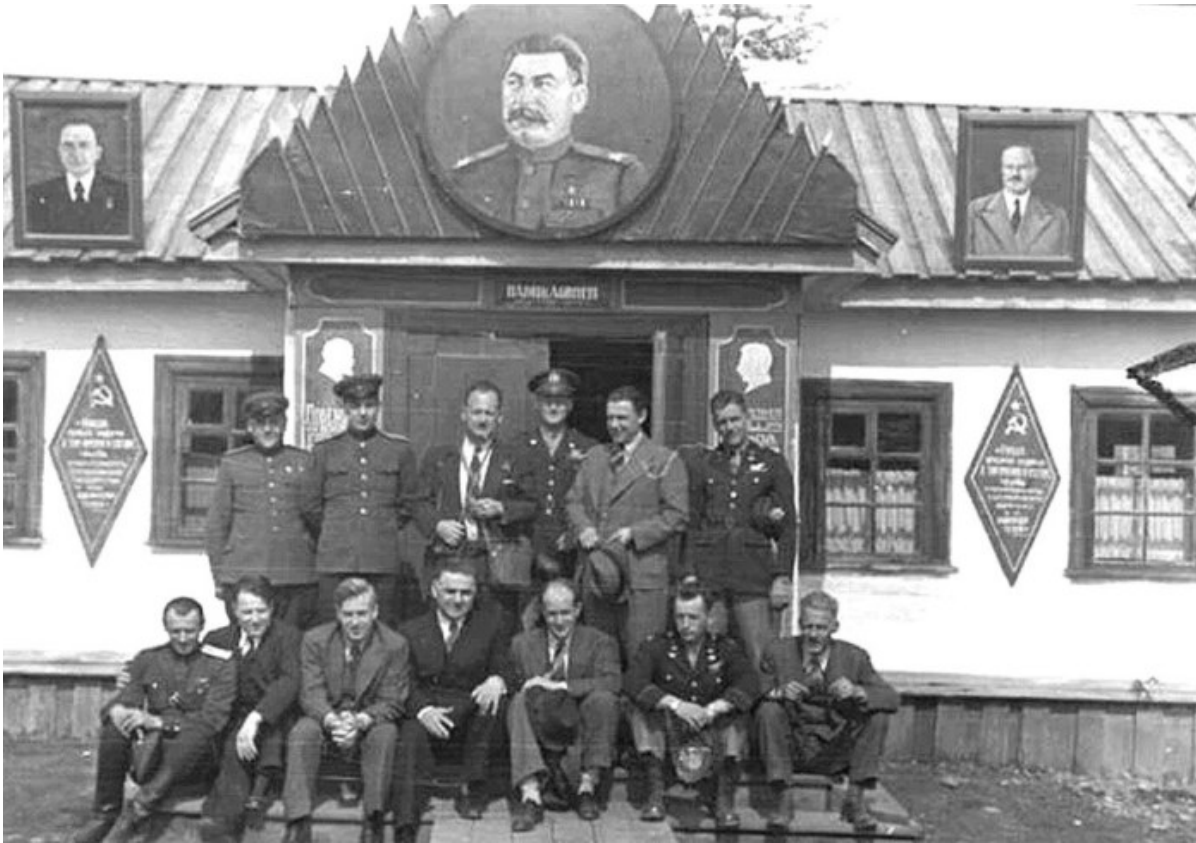
Henry Wallace, FDR's Vice President, third from left in front row, with Russian guides in Moscow in 1944.

The Soviets had borne the brunt of the Nazi onslaught, losing some 27 million people during the war. Had FDR lived into the post-war period, respect for that sacrifice and for the Soviet people would have dictated U.S. policy, and potentially cut the legs out from under the British initiative to go straight from the war against the Nazis to war against the Soviet Union.