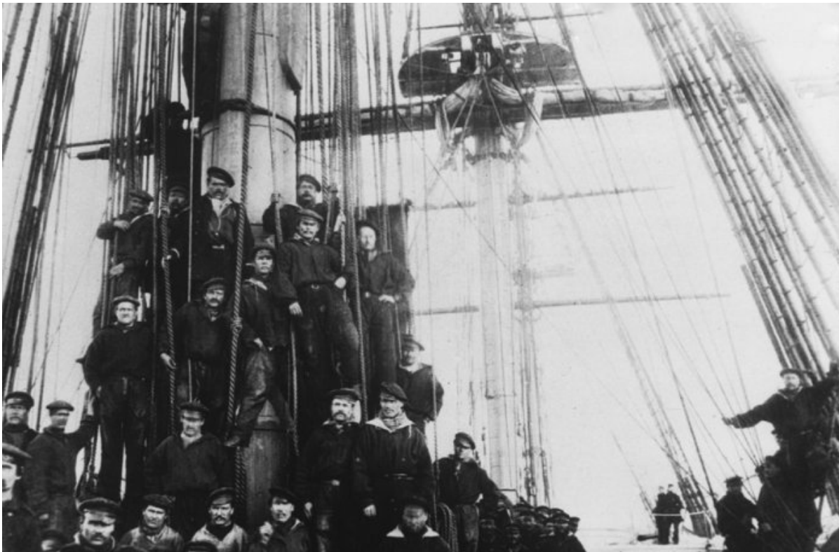
Crew of the Russian frigate Oslaba while docked in New York harbor in 1863.

The Russian fleet was greeted in lavish style in New York City, with parades and a Grand Ball. When it went on to the port of Alexandria, Virginia, in December, Mrs. Lincoln herself joined the celebrations. San Francisco also put out the welcome mat, although in less lavish style. The fleets stayed in American waters until the spring of 1864.