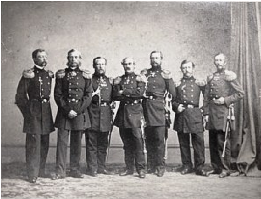
Russian naval officers during their trip to the United States during the Civil War.

The “maintenance of the American Union as one indivisible nation” was the Russian objective. It was also backed up by Russian refusal to join a British-inspired “mediation” effort between North and South, which would, in effect, have resulted in recognition of the Confederacy as a separate nation.