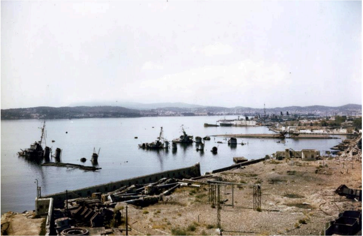
Major French Naval base Toulon, photo taken in 1944. Submerged hulls of VSS Tartu, Cassard, L'Indomptable, Vautour, Aigle, Condorcet are seen.