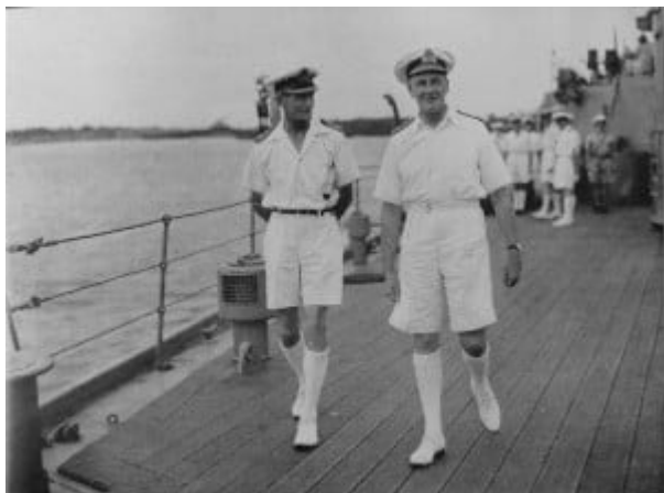
On the right - Admiral James Somerville (1882-1949)

Admiral Gensoul rejected the British ultimatum. This was reported to Churchill, and at 18:25 (on the eve of the expiration of the ultimatum) the commander of the British squadron was given the final order from his prime minister: " French ships must comply with our terms or sink themselves or be sunk by you before dark. " [10]