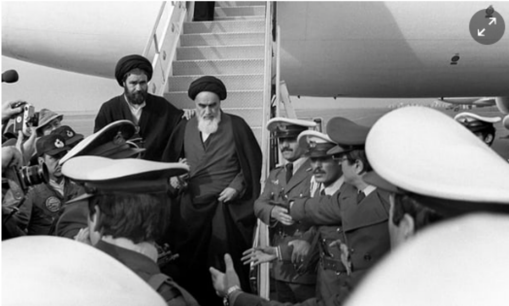
i The Ayatollah Ruhollah Khomeini is welcomed at Tehran airport on 1 February 1979 on his return from exile in France.

Documents seen by BBC suggest Carter administration paved way for Khomeini to return to Iran by holding the army back from launching a military coup