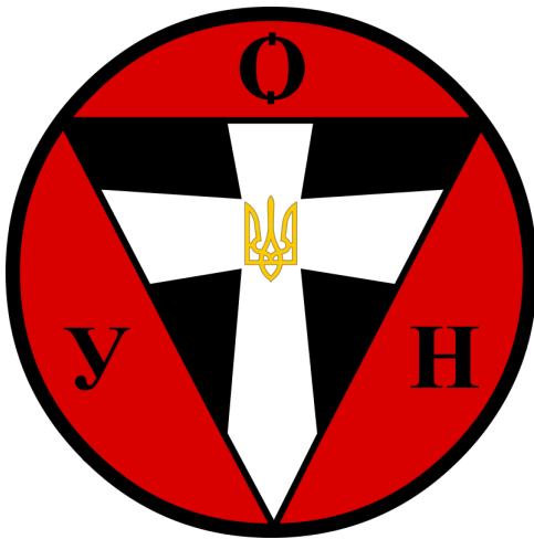
Image: Emblem of OUN-B

All across the countryside the same pattern was repeated. The OUN/B held Independence Day ceremonies, destroyed all communist symbols, put up Ukrainian flags and Nazi Swastikas and then launched pogroms. There were up to 140 Pogroms in Western Ukraine in July 1941 and they claimed 35,000 to 39,000 victims. The biggest pogroms besides Lvov were in Ternopil and Zolochiv. During this period the OUN/B were not merely carrying out German orders but were enthusiastically carrying out genocide in line with their own ideology.