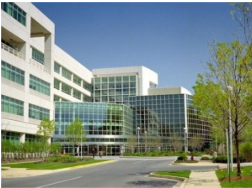
U.S. National Archives at College Park, Maryland

After a little digging, Iwakura found the color footage at the National Archives. About one-fifth of it showed the devastation of Hiroshima and Nagasaki after the atomic bombs went off. According to a shot list, reel #11010 included, for example: “School, deaf and dumb, blast effect, damaged Commercial school demolished School, engineering, demolished. School, Shirayama elementary, demolished, blast effect. Tenements, demolished.” Included were many minutes of stoic survivors sadly, or in anger, displaying their burns and scars. The rest of the footage was shot in several other cities.