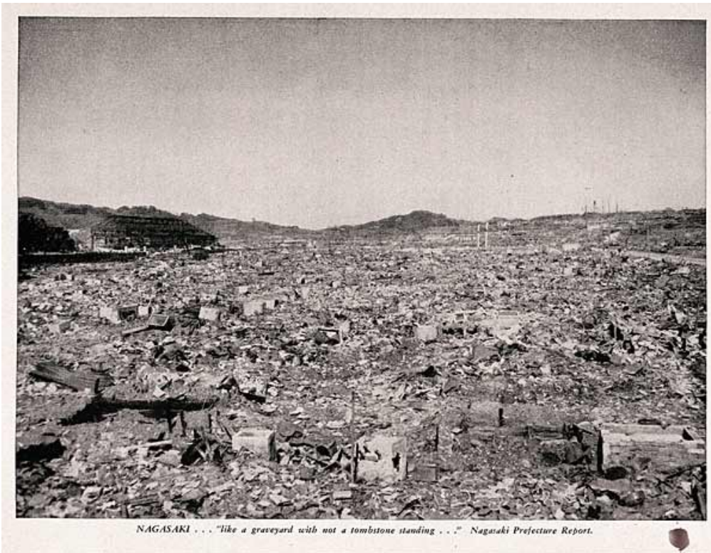
Nagasaki after US bombing (August 9, 1945)

If there should be any doubt as to the underlying facts, it should be recalled that US military forces were scarcely able to defeat an exhausted German Wehrmacht as late as 1944. 5 Had the Soviet Union not destroyed most of the Nazi fighting capacity in Eastern Europe, it is very doubtful that the famous "D-Day" would have been more than a disaster.