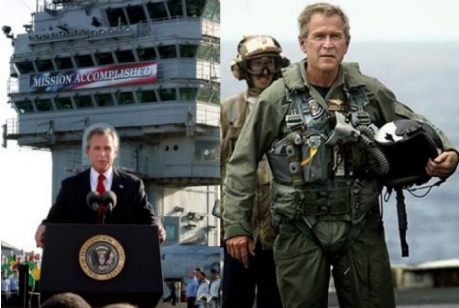
Pubescent Sexual Fantasy: G W Bush, “Mission Accomplished”.

Hence the standing policy of the US regime since 1945, since that 6th of August when the Enola Gay — an aircraft so beloved that it has a special exhibition space in the country’s premier historical museum — dropped its lethal load, has been to prepare for the great hordes of non-whites at the gates, with fast, fantastic fatality.