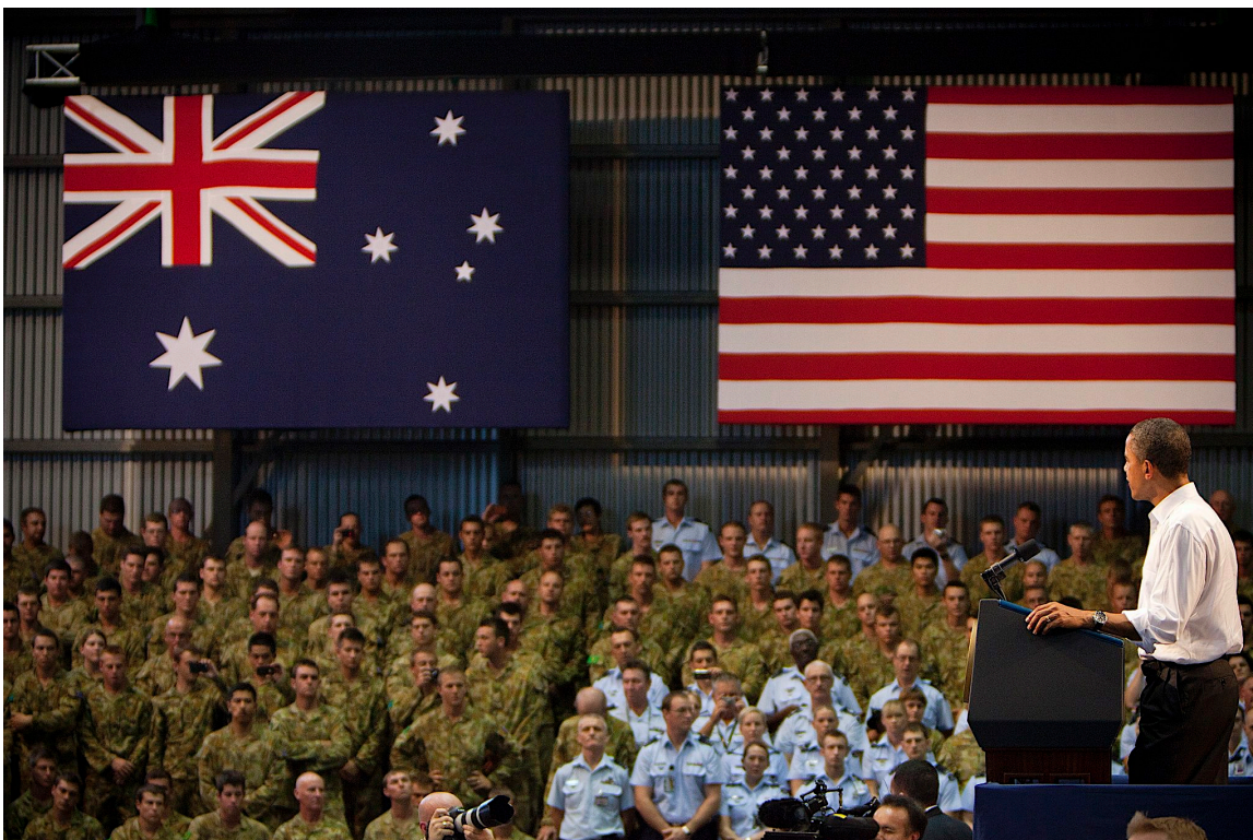
Obama speaks about 60 years of the U.S.-Australian alliance in Darwin, Australia, Nov. 17, 2011.

Whereas Clinton never concealed her warmongering, Obama was a maestro of marketing. “I state clearly and with conviction,” said the new president in 2009, “that America’s commitment is to seek the peace and security of a world without nuclear weapons.”