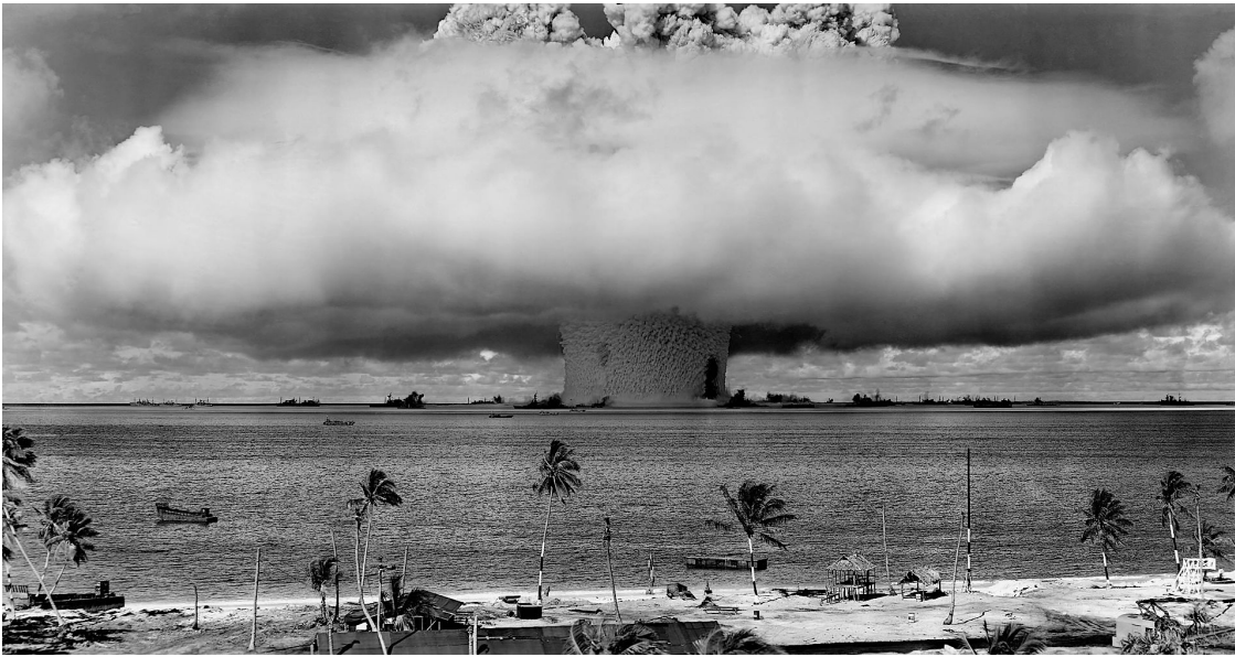
“Baker Shot”, part of Operation Crossroads, a U.S. nuclear test at Bikini Atoll in 1946.

“human uptake”. There they are in flickering film, in their white coats, attentive with their clipboards. When an islander died in his teens, his family received a sympathy card from the scientist who studied him.