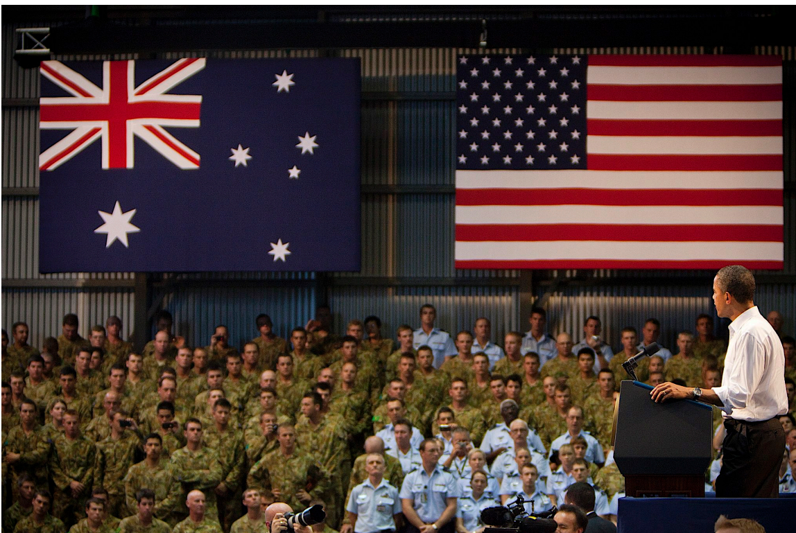
Obama speaks about 60 years of the U.S.-Australian alliance in Darwin, Australia, Nov. 17, 2011.

Whereas Clinton never concealed her warmongering, Obama was a maestro of marketing. “I state clearly and with conviction,” said the new president in 2009, “that America’s commitment is to seek the peace and security of a world without nuclear weapons.”