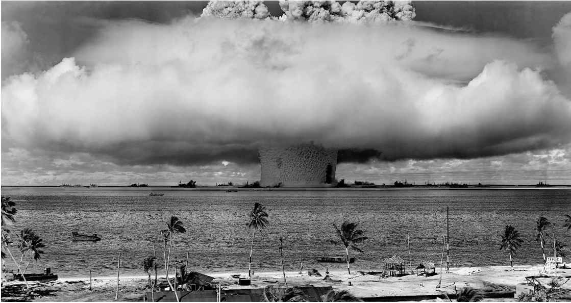
“Baker Shot”, part of Operation Crossroads, a U.S. nuclear test at Bikini Atoll in 1946.

“human uptake”. There they are in flickering film, in their white coats, attentive with their clipboards. When an islander died in his teens, his family received a sympathy card from the scientist who studied him.