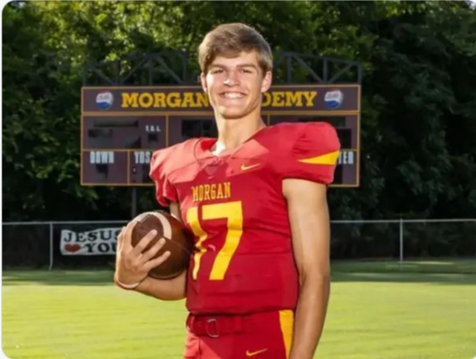
MLFootball and 4 others

He was known for his kindness, generosity, & love, his mother said in a statement.