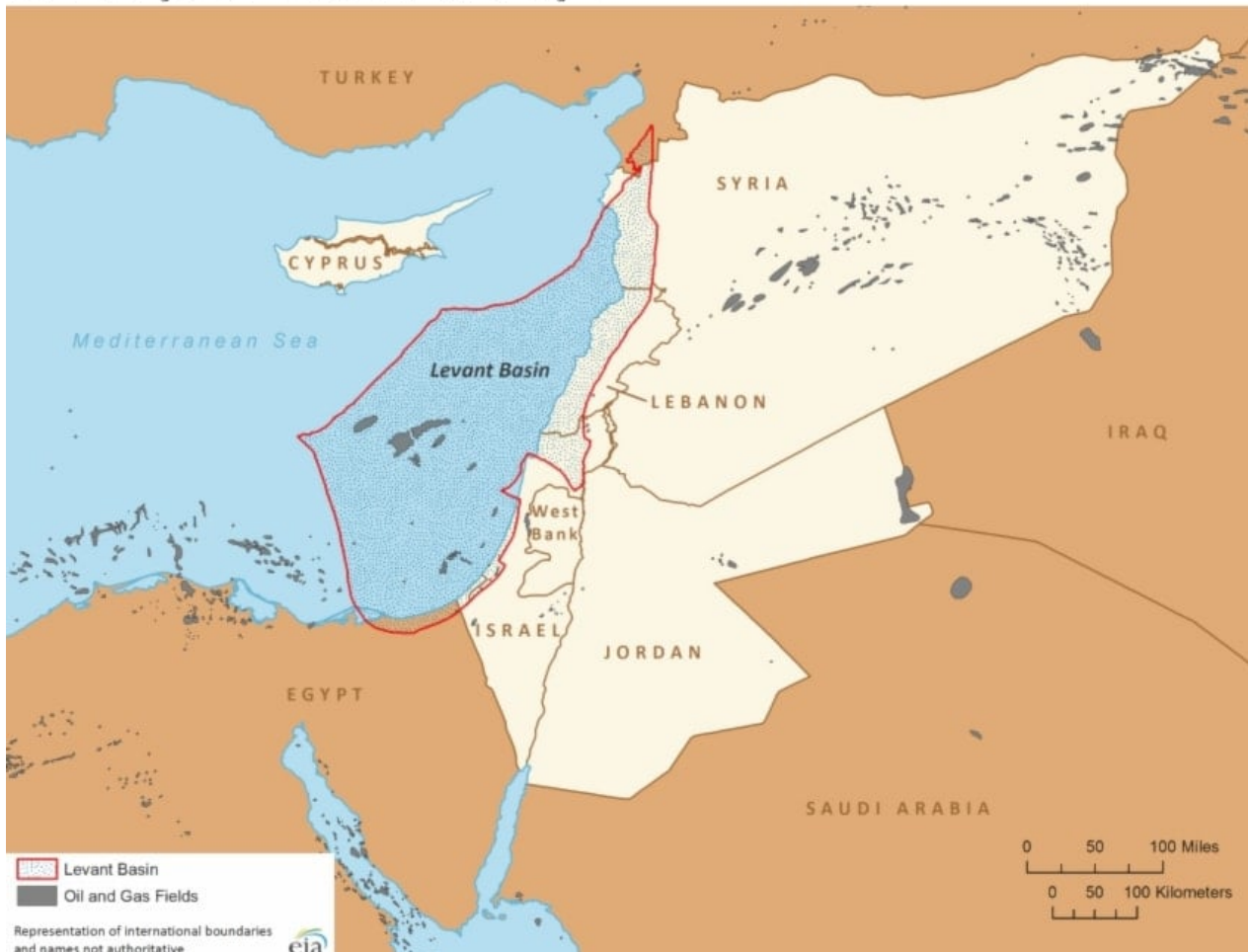
Oil and natural gas fields in the Eastern Mediterranean Region

Ultimately, Syria would not allow Western corporations to extract its gas, nor would Qatar's ambitious oil pipeline, meant to pass through Syria, ever materialize. Coincidentally, soon after, war broke out in Syria, with Qatar and "Israel" being two of many parties funding terrorist groups to try and overthrow Damascus.