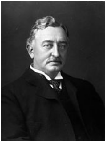
Cecil Rhodes

Before launching pell-mell into the argumentative labyrinth it is apropos that we first sketch the central cast of characters of this grim story.