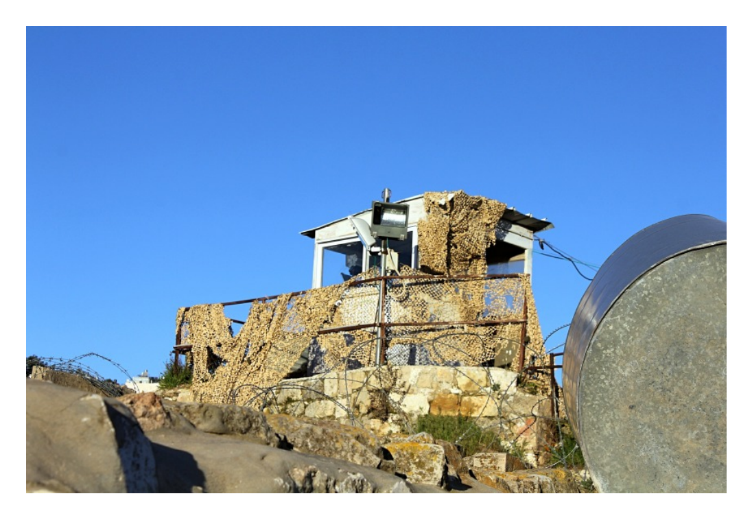
Israeli military post atop a Palestinian home in Hebron's old city.

Palestinian residents of Shuhada Street are not permitted to drive there, no matter how old or infirm, even to bring heavy items to their homes. But Israeli settlers are free to drive along it, or take buses that only Israelis may use.