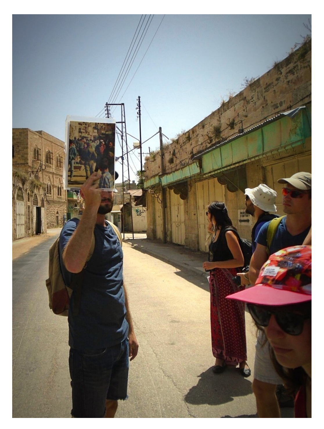
Breaking the Silence tour, Shuhadda Street, Hebron.

The soldiers created an organisation called <u>Breaking the Silence</u>. The name reflects their desire to speak the truth about what young Israelis experienced while serving their country. They have built up a large library of testimonies from serving and former soldiers.