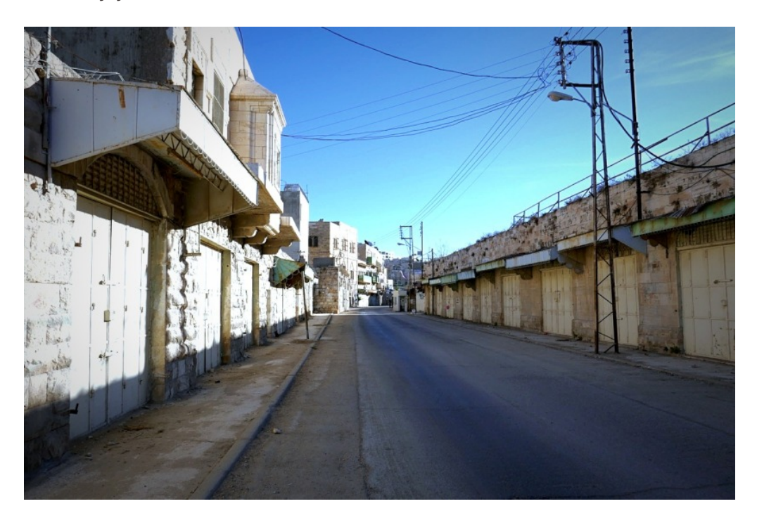
Shuhadda Street, Hebron.

Once the city's main thoroughfare, Shuhada street in Hebron's old city was designated a Closed Military Zone (CMZ) in 2015, though it had already been closed to Palestinian traffic for many years before that.