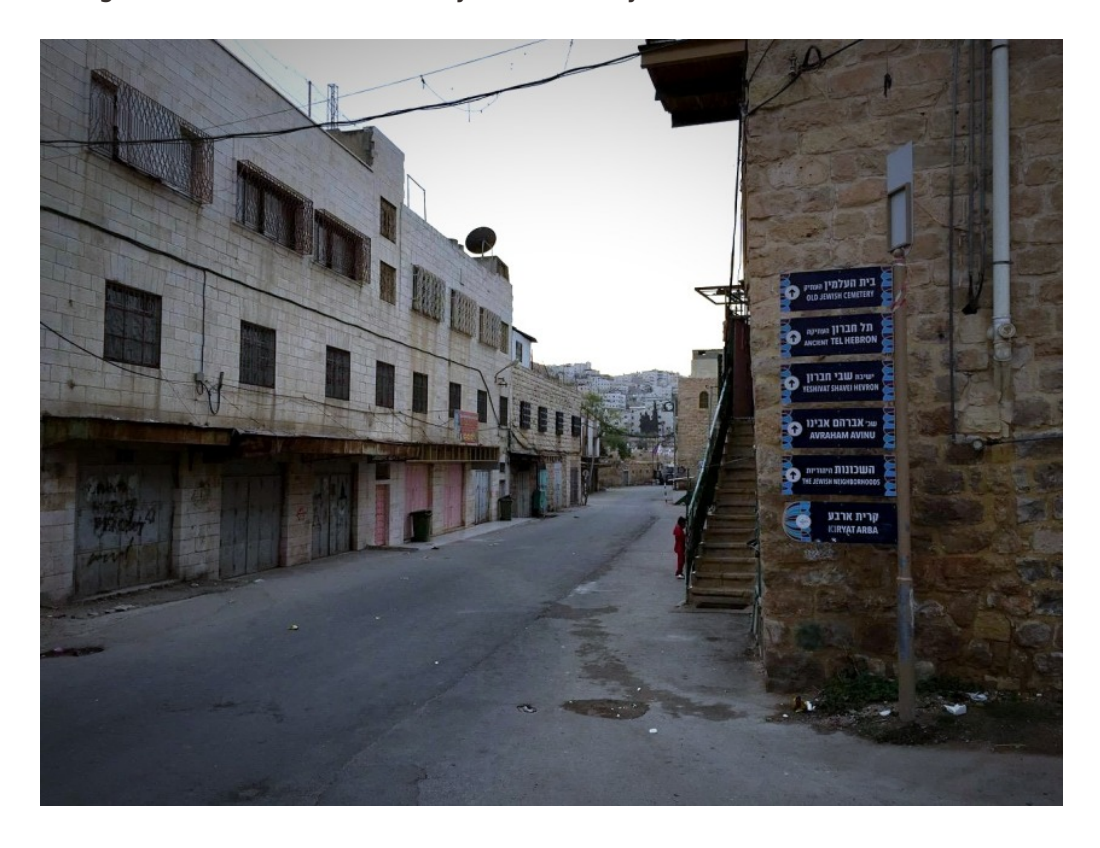
Shuhadda Street, Hebron.

Palestinian residents of Shuhada Street are not permitted to drive there, no matter how old or infirm, even to bring heavy items to their homes. But Israeli settlers are free to drive along it, or take buses that only Israelis may use.