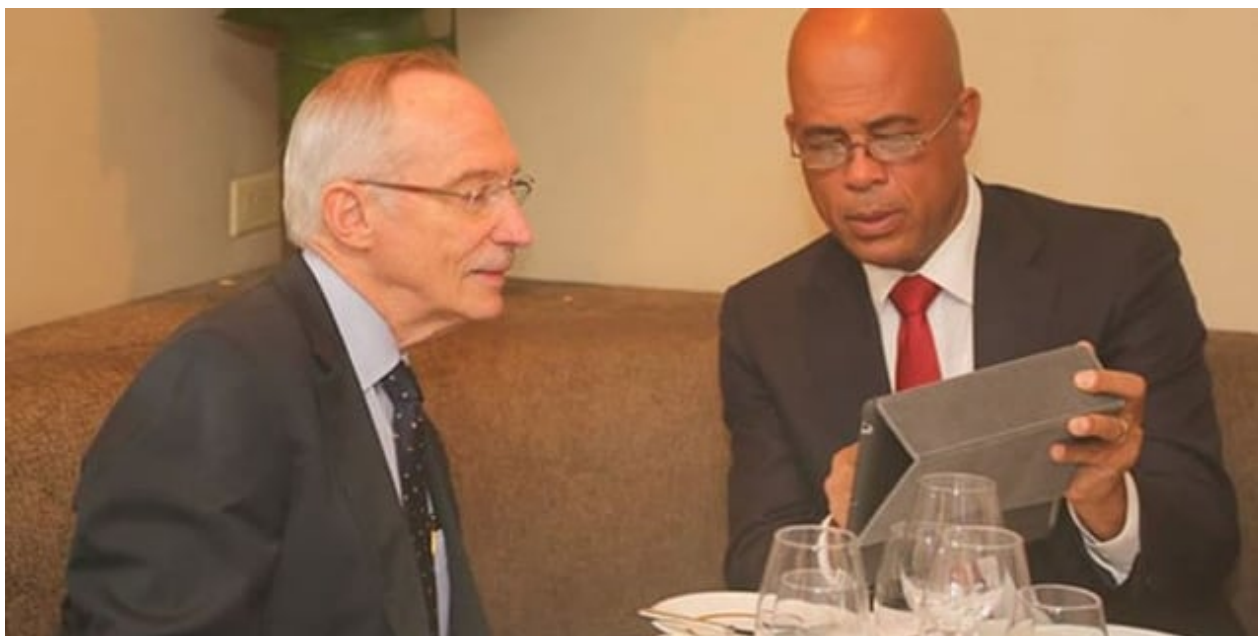
Edmond Mulet and Haitian President Martelly

Latin America is beginning to reap the fruits that it sowed in Haiti during the last decade. Its armies have become so fat as to control, either by quiet coups or default, the superficial democracies in Argentina, Bolivia, Brazil, Chile, Colombia, Ecuador, El Salvador, Guatemala, Peru, and Uruguay, and the outright dictatorships in Honduras and Paraguay . The most obvious consequence has been the return home to roost of the “peacekeepers”: soldiers of fortune who are so inured to urban warfare against black and brown people that they can, as part of their armies and militarized police, cheerfully participate in domestic “pacification”. Today, we have a big shot returning from the United Nations Mission for the Stabilization of Haiti ( MINUSTAH ), one who descends from the Guatemala of Efraín Ríos Montt (1982-1983), the genocidal dictator whose sentence was annulled in 2013 after a hopeful court case turned into a project to demoralize an entire population: we have Edmond Mulet, the Assistant Secretary-General for Peacekeeping Operations at the UN and probably Guatemala’s next president.