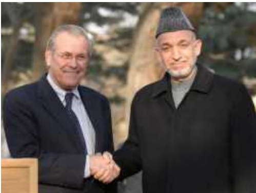
Rumsfeld and “elected” President Karzai

Rumsfeld retired, but the disastrous Iraq and NATO ‘plans’ roll on unobstructed, with a little help from Rumsfeld’s UN-Nato ally, Victoria Nuland, (US Permanent Representative to NATO)