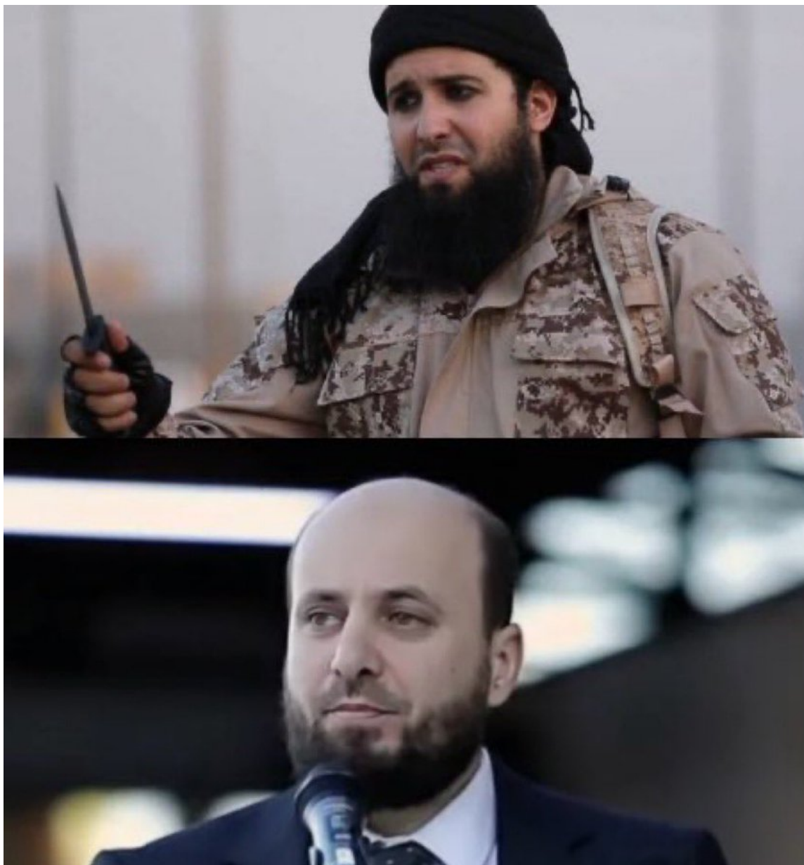
Mohammed al-Bashir before and after his Western Facelift

considerable influence, the United States is exploring removing HTS' terrorist designation , two current administration officials and a former senior U.S. official told NBC News. Although Washington will watch closely the militant group's moves from its new political vantage point. Why a photo of Syria's interim leader could hint at trouble ahead , NBC News