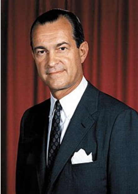
Richard Helms

documented in his extensive CIA history , Legacy of Ashes , Johnson instructed then-CIA Director Richard Helms to break the law: