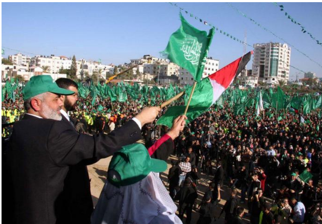
Hamas leaders at a rally in Gaza.

“The movement continued to fire rockets into Israel under devastating bombardment, and it looks likely to emerge politically stronger when the war is over...”