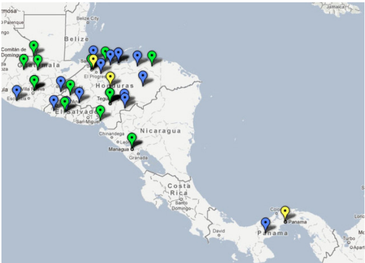
Attacks on journalists in Central America: yellow/arrests, green/attacks, blue/killings.