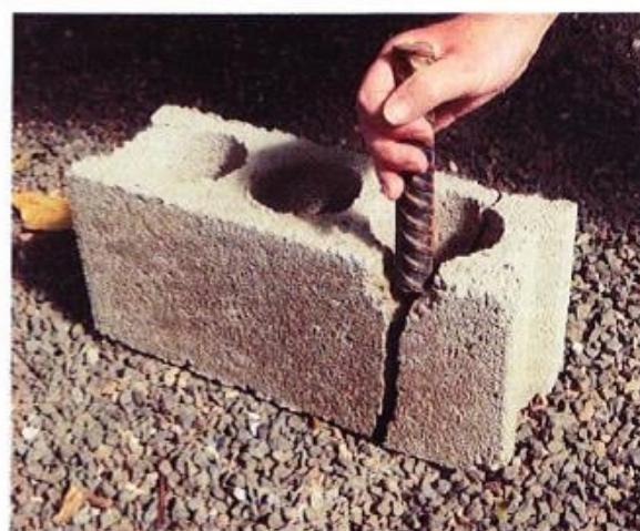
Example of the typical, locally handmade, 600 psi masonry block used for the housing units

Image from internal USAID document, showing sub-standard concrete used.