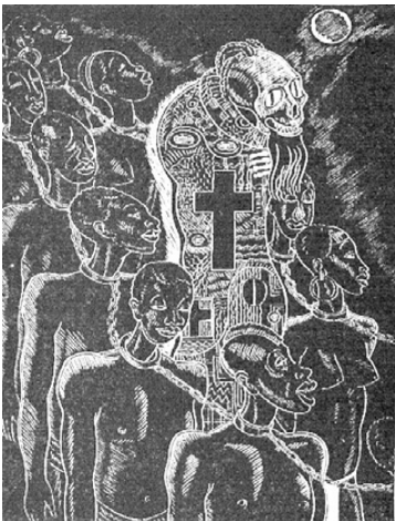
Endless slave caravans wound their mournful way through

“As for your male and female slaves whom you may have: you may buy male and female slaves from among the nations that are around you. You may also buy from among the strangers who sojourn with you and their clans that are with you, who have been born in your land, and they may be your property. You may bequeath them to your sons after you to inherit as a possession for ever”. Leviticus 25: 44-46 (Word of the Judeo-Christian god, according to its chosen people’s religious books)