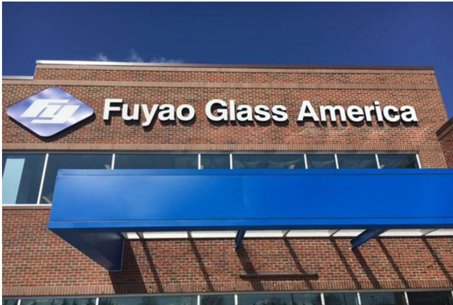
Fuyao Glass America