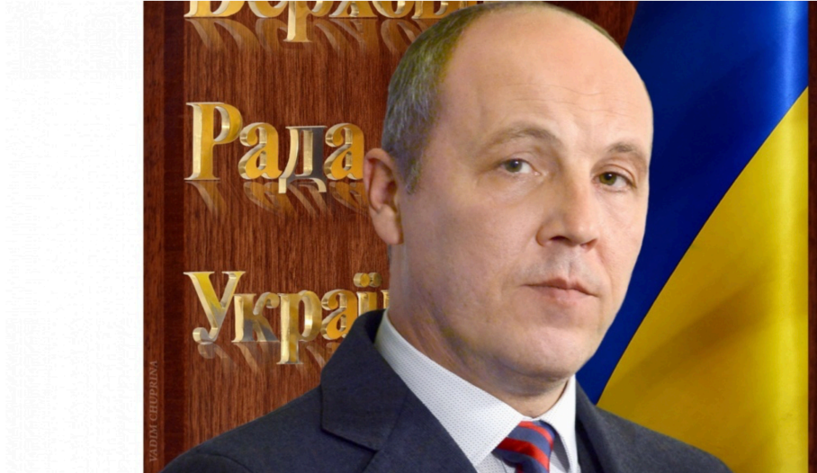
MS Ukrainian parliament speaker Andriy Parubiy, who founded the fascist Social-National Party of Ukraine, now Svoboda, and is a vocal fan of nazi collaborator and Holocaust war criminal Stepan Bandera