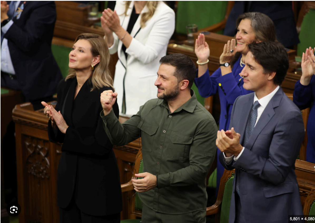
Nazi-linked veteran received ovation during Zelenskyy's Canada visit - POLITICO

There can be no peace when US-NATO are actively supporting and financing Neo-Nazism in Ukraine.