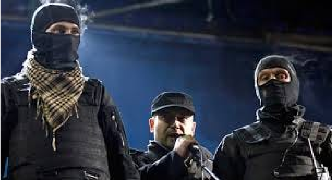
Dmytro Yarosh (Centre) EuroMaidan Coup d'Etat