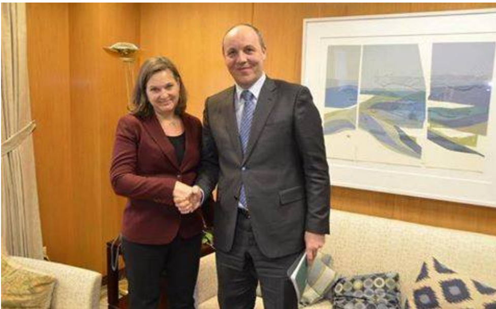
Parubiy with Assistant Secretary of State Victoria Nuland (Obama Administration)

The US Congress, Canada's Parliament, the British Parliament, the European Parliament, have invited and praised M. Parubiy.