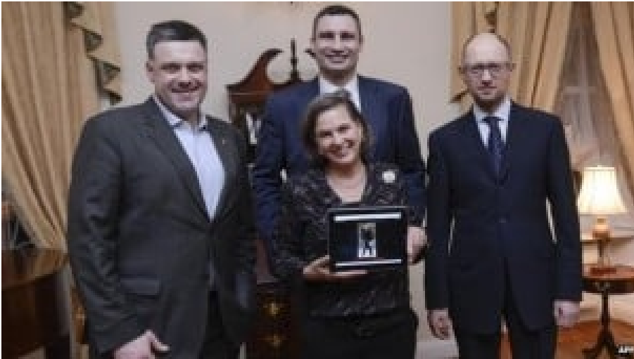
Tyannybok (leader of Neo-Nazi Svoboda Party (left), Yatseniuk (right)