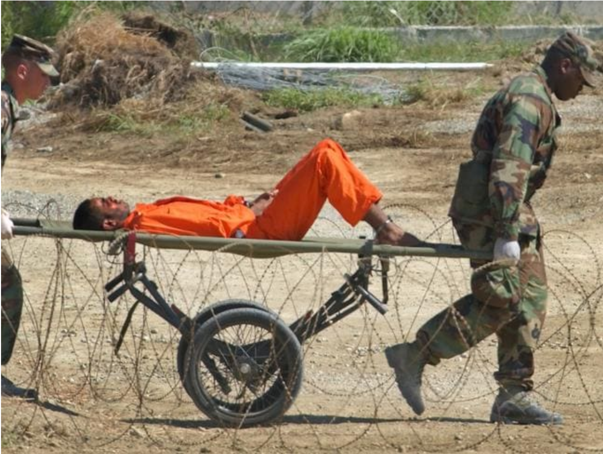
A detainee is carried on a stretcher before being interrogated.

There are many questions over what has gone on at the controversial facility, which still holds about 150 prisoners.