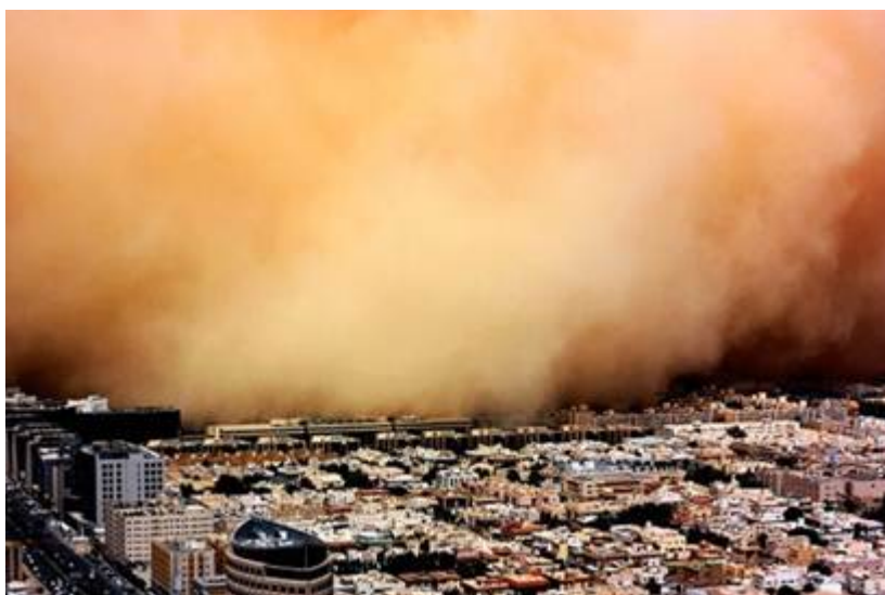
Sandstorm hitting Riyadh, Saudi Arabia, 2012

Every Spring and Summer, during a period of low pressure over the Persian Gulf, powerful winds known as the "shamals and sharqi," sweep down from the north and north east into Saudi Arabia, whipping up ever more grains of sand as they head south and south west across the Arabian Desert. Frequently, these sandstorms become gargantuan in size - hundreds of meters high and kilometers wide and in length of dense roiling particulate, choking the lungs of those exposed, blocking out the sun completely and, by the time they are over, burying whole towns, sometimes even large cities like Riyadh, in a meter deep or more of sand.