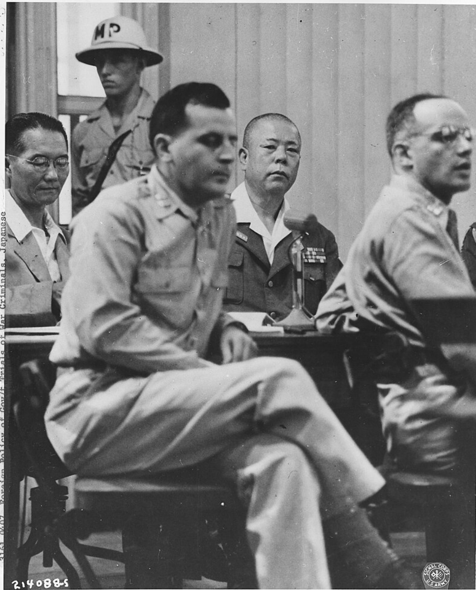
Yamashita (second from right) at his trial in Manila, November 1945