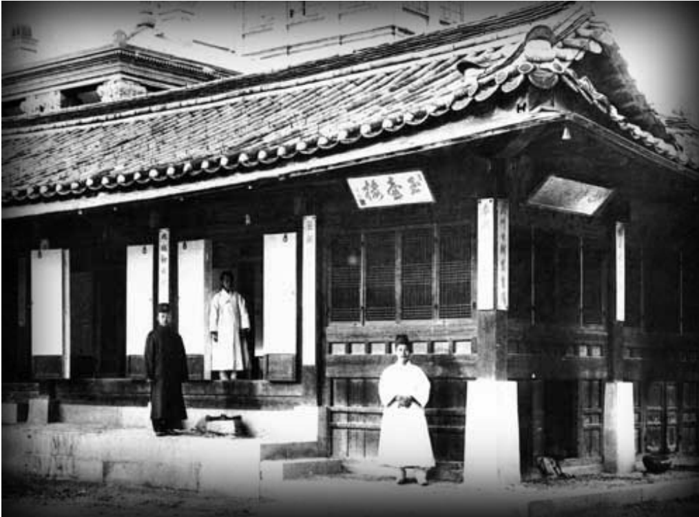
Okhoru Pavilion in Geoncheongjeon, Gyeongbokgung where the Empress (Queen Min) was killed.