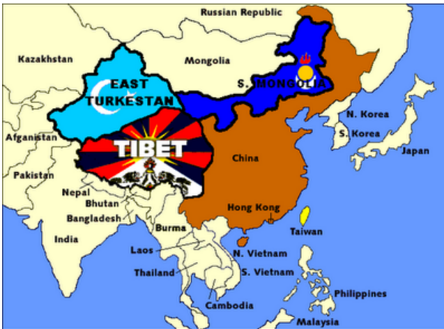
Image: The US has much to gain by backing separatists in western China.

In this it is clear that “Uyghur terrorism” is simply another attempt to conceal what is essentially yet another tool devised to achieve and maintain American global hegemony. Looking at a map of China, it is clear why this otherwise minuscule, obscure ethnic group has been propelled to center stage by American interests.