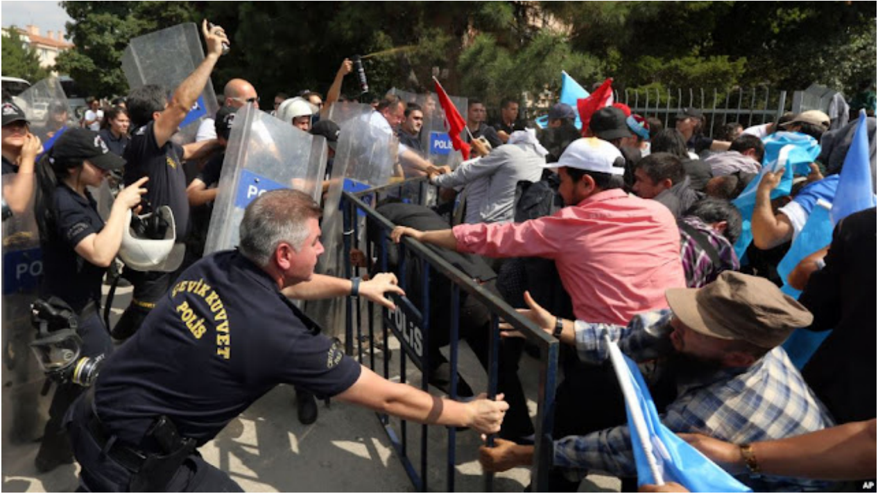
Image: The US-based and funded World Uyghur Congress admits it led mobs on the same day the Thai consulate was attacked. Their mobs in Ankara also turned violent, however Turkish police were able to maintain control. While WUC claims they have no ties to the Grey Wolves they claim were likely behind the consulate attack, they admit they, like WUC itself, have been funded by the US government.

During the days following the Bangkok blast, the Foreign Correspondents Club of Thailand (FCCT) would give a presentation implicating the Uyghur-linked Turkish “Grey Wolves” terrorist network.