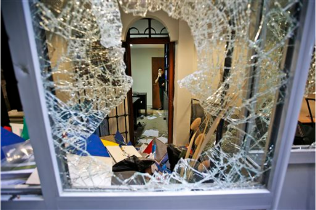
Image: Thailand's consulate in Istanbul Turkey was destroyed on the same day Thailand deported Uyghur terror suspects back to China. One may find it difficult to speculate who on Earth currently possesses the operational capacity to organized a same-day retaliation anywhere in the world besides a handful of actors - NATO among them.

WUC admits that violence broke out among the mobs it was leading in Ankara but denied any affiliations with the protesters in Istanbul who attacked the consulate and destroyed it on the same day, in the same country, over the same alleged grievances. WUC itself suggested it was the work of the "Grey Wolves," an organization they admit was "clandestinely funded by the US government." The Grey Wolves are comprised of Turks and Uyghurs, and throughout the Cold War served as part of NATO's "stay behind networks" referred to as Gladios. They were used to purge NATO's enemies from Turkey in bloody violence that would leave over 6,000 dead. Since the Cold War, the Grey Wolves have set up operations internationally, including terrorist training camps in Xinjiang, China - all indicating that NATO's Gladio has gone global.