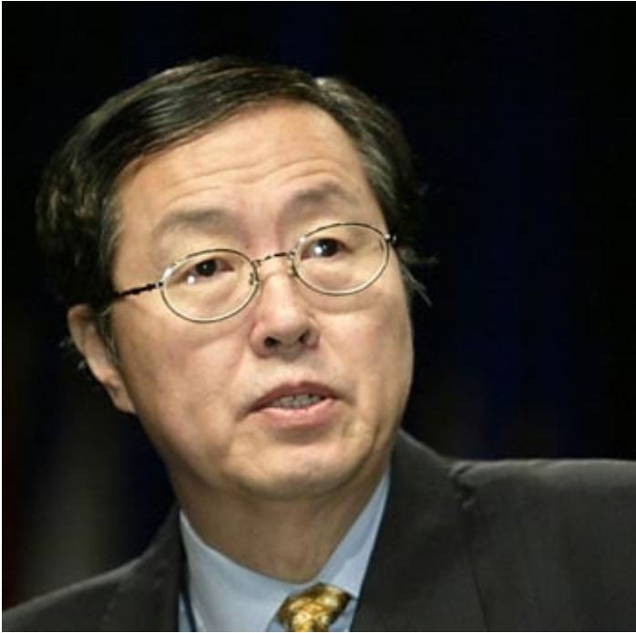
Wary of dollar, China wants super-sovereign currency - 2009-06-26