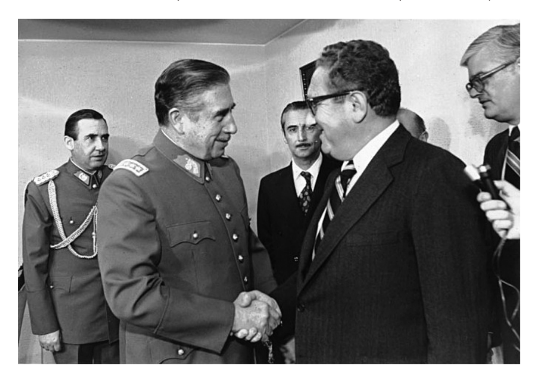
Chilean leader Augusto Pinochet shaking hands with U.S. Secretary of State Henry Kissinger in 1976

In the month following the coup d'etat, the price of bread increased from 11 to 40 escudos overnight .<sup>2</sup> This engineered collapse of both real wages and employment under the Pinochet dictatorship was conducive to a nationwide process of impoverishment.