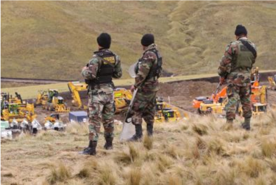
Glencore Titaya, Observadores Glencore

According to several accounts from the local population as well as from people in the town of Espinar, Glencore intended to reroute the small stream providing the only water source for the six or so villages higher up on the mountain. This is further corroborated by the large pile of big-sized pipes, deposited on the land next to the small stream. A nearby gigantic earth moving machine and fresh tracks traversing the small water way were also clear signs that water deviation works were planned.