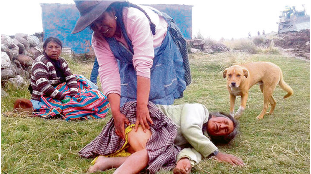
Agresión. Mujeres muestran golpes de la paliza policial.

An elderly woman (65) was beaten so severely, she was resting and moaning in a rickety stone shack which apparently was destroyed by Glencore's bulldozers the week before and hastily rebuilt by the local population. The woman had pain all over her body, could not move, and got no medical attention, no pain medication - nothing - she was a 'high risk' case. Later, we learned, she was miraculously recovering with the care of the villagers.