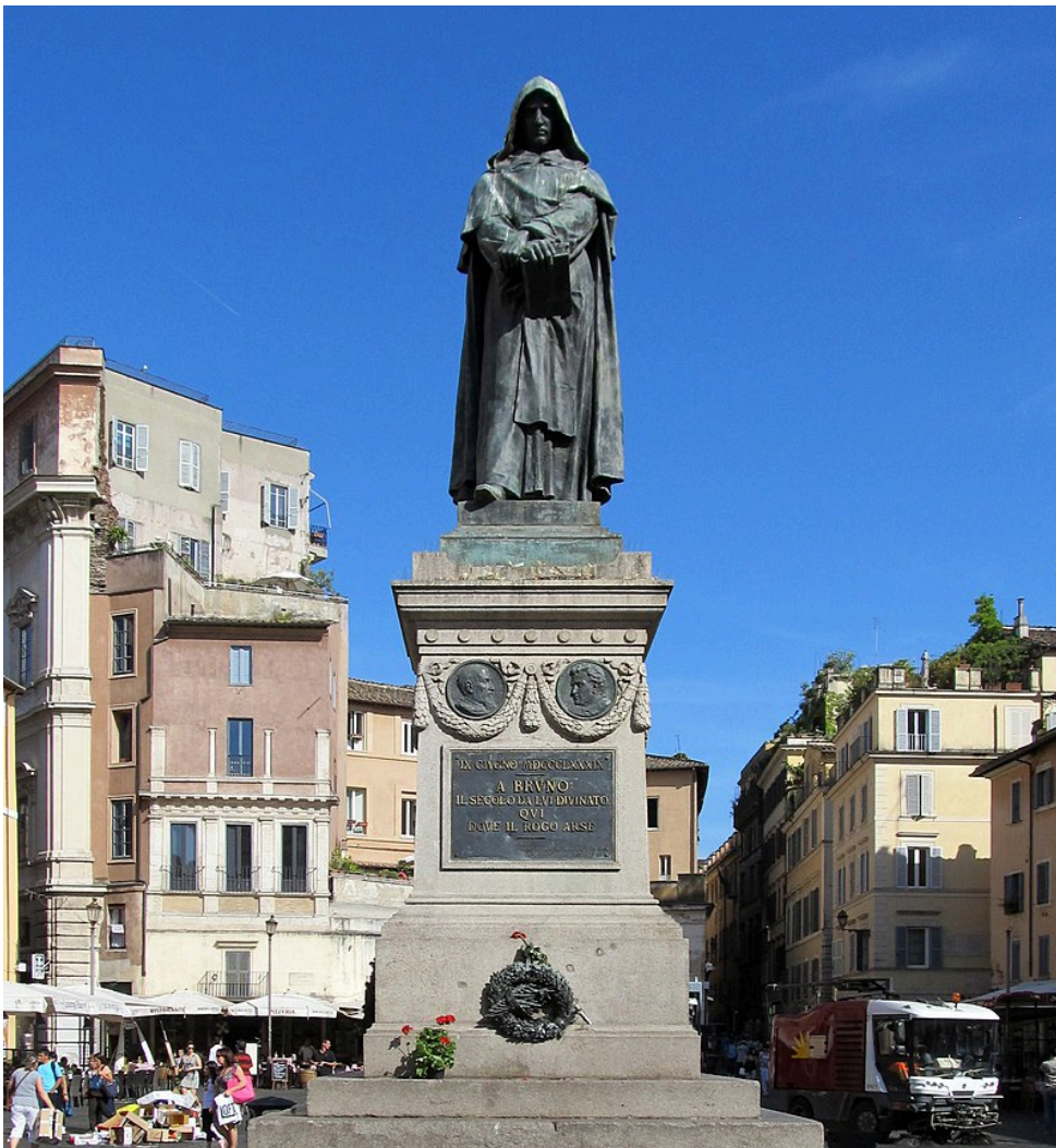
The monument to Bruno in the place he was executed, Campo de' Fiori in Rome (Licensed under CC BY-SA 2.0)

I have a modest claim to make: we need Bruno today more than ever. This is because he represents an intellectual antidote to the prevailing ideology of today which tells us that we are doomed to finitude, which comes down politically to the assertion that there is no alternative to the reign of global capitalism. Of course, Bruno did not know about capitalism, globalization or neoliberalism. What he did know however is that humanity is infinite. That we are limited only by our own narrowness of vision.